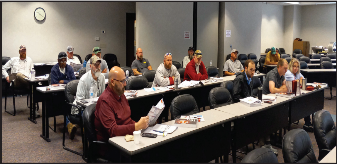
Employees with Pine Bluff Arsenal's Directorate of Public Works attend a National Electric Code training class at the Arsenal's training center in October.