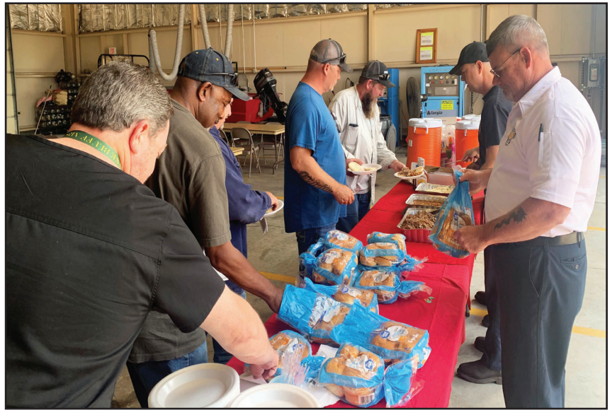
Pine Bluff Arsenal's Fire Department and Federal Credit Union partnered during this year's Fire Prevention Week and served more than 160 meals to PBA employees at the fire house Oct. 11. This year Fire Prevention Week was recognized Oct. 9-15, 2022 also celebrates the 100th anniversary of the yearly recognition. This year's theme is "Fire Won't Wait. Plan Your Escape". The week is recognized every year on the installation with emergency personnel conducting fire drills and educating everyone on fire prevention and safety. PBA firefighters during their drills during the week talked about the need for planning and practicing home fire escapes, making sure everyone knows the plan, and checking and testing smoke alarms.