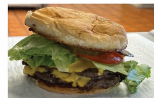
Actual Double Cheeseburger Made By: Stephen!

Bottle Sodas $1.85 Minute Maid $1.85 Powerades $1.60 Water $1.50 Can Sodas $1.10