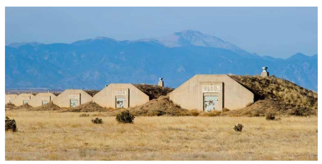
CMA is responsible for the safe and secure storage operations at the Army's two remaining chemical weapons stockpile sites located at Pueblo Chemical Depot, Colorado, and Blue Grass Chemical Activity at Blue Grass Army Depot, Kentucky.

For more information, visit https://phc.amedd.army.mil <a href="https://phc.amedd.army.mil/">https://phc.amedd.army.mil/</a>.