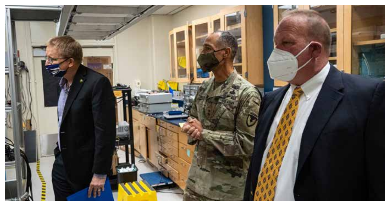
U.S. Army Communications-Electronics Command (CECOM) Commanding General and APG Senior Commander, Maj. Gen. Robert Edmonson II tours the Adelphi Laboratory Center (ALC) during a formal interactive tour of the organization, Sept. 24, 2022.

Our myriad world-class training, modeling and simulation test facilities and capabilities cover 66,000 acres across Aberdeen Proving Ground, Maryland, with access to land, sea, air and rail.