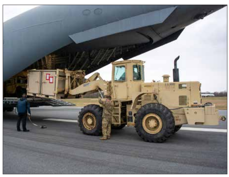
Soldiers from the 20th CBRNE Command prepare at APG for a Prominent Hunt 21 exercise.

The U.S. Army Combat Capabilities Development Command Armaments Center Firing Tables and Ballistics Division is responsible for ballistic characterization of munitions and the development of aiming data and ballistic fire control information for all unguided and certain