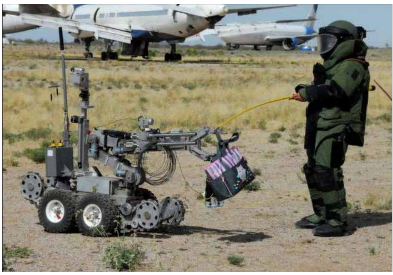
An explosive ordnance disposal Soldier places a suspected bomb on a robot for safe removal during a Ravens Challenge exercise.

tions at the Army's two remaining chemical weapons stockpile sites located at Pueblo Chemical Depot, Colorado, and Blue Grass Chemical Activity at Blue Grass Army Depot, Kentucky. In partnership with the Federal Emergency Management Agency, CMA works with state and local governments to implement the Chemical Stockpile Emergency Preparedness Program, which educates, prepares and protects communities surrounding the stockpiles. The CMA director acts as implementing agent, delegated by the Department of Defense, to ensure the Army complies with the