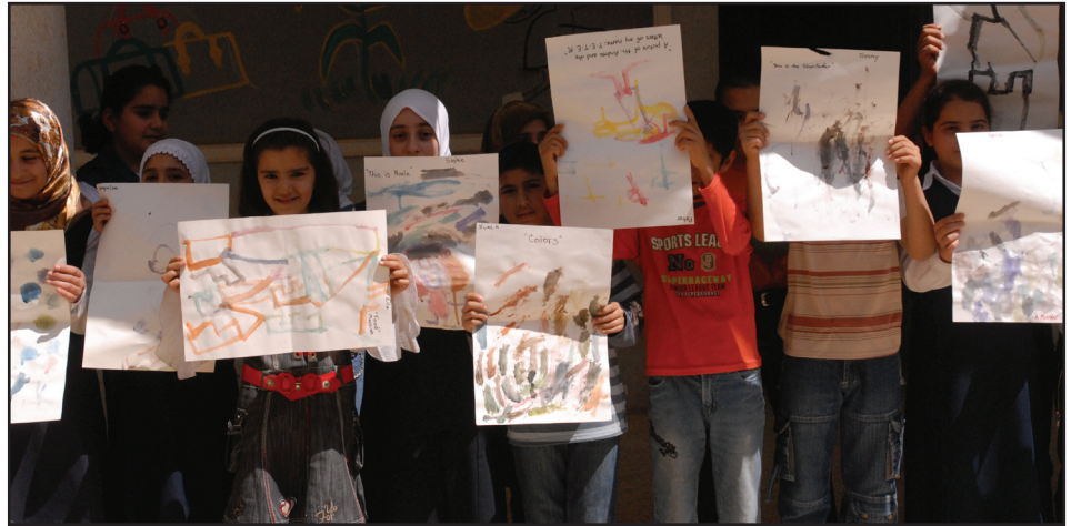
Above: Iraqi students display art drawn by U.S. children for students at Karkar Baba Elementary School, Kirkuk province, April 15.