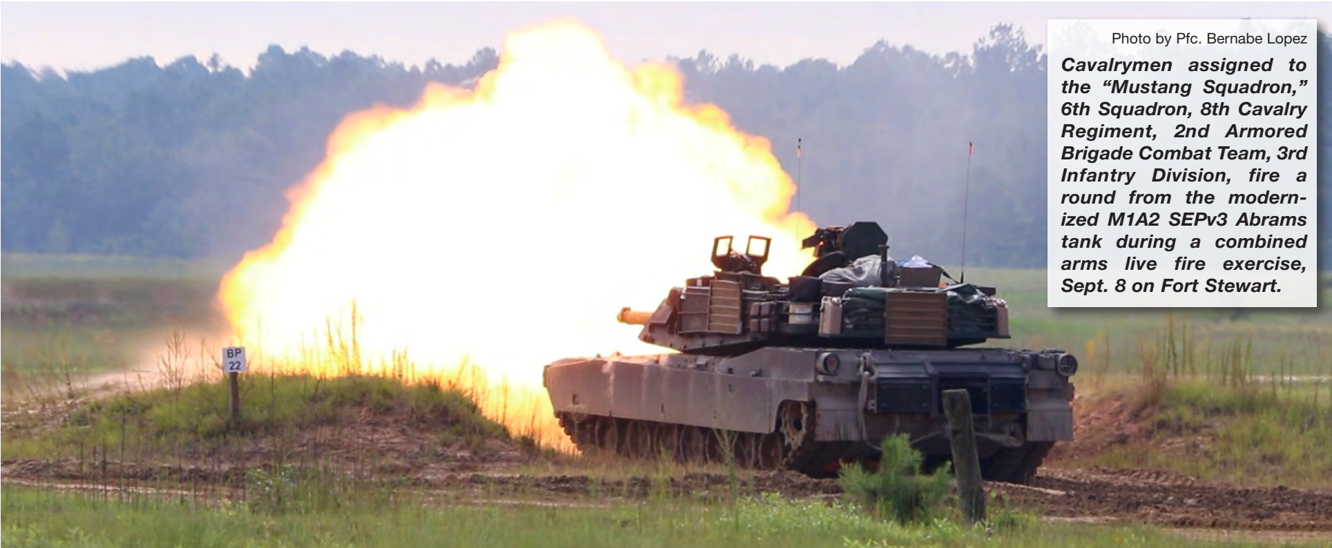
Cavalrymen assigned to the “Mustang Squadron,” 6th Squadron, 8th Cavalry Regiment, 2nd Armored Brigade Combat Team, 3rd Infantry Division, fire a round from the modernized M1A2 SEPv3 Abrams tank during a combined arms live fire exercise, Sept. 8 on Fort Stewart.