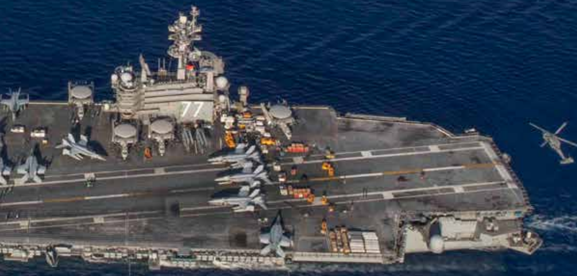
The Nimitz-class aircraft carrier USS George H.W. Bush (CVN 77) receives ordnance from the Nimitz-class aircraft carrier USS Harry S. Truman (CVN 75) during a replenishment-at-sea Aug. 27, 2022.