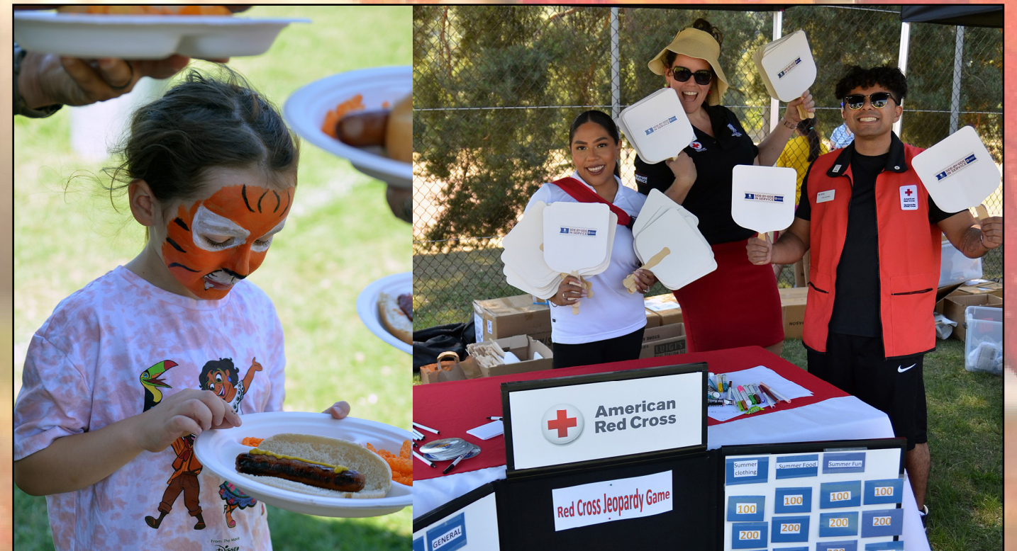
(Left) A patron at Landstuhl Regional Medical Center's Organizational Day enjoys a meal and (right) volunteers with the Landstuhl American Red Cross pass out fans during the Organizational Day, Aug. 12. The event, which included free meals, games and live music from the U.S. Army Europe Africa Band, aims to build resiliency and promote esprit de corps amongst staff and families.