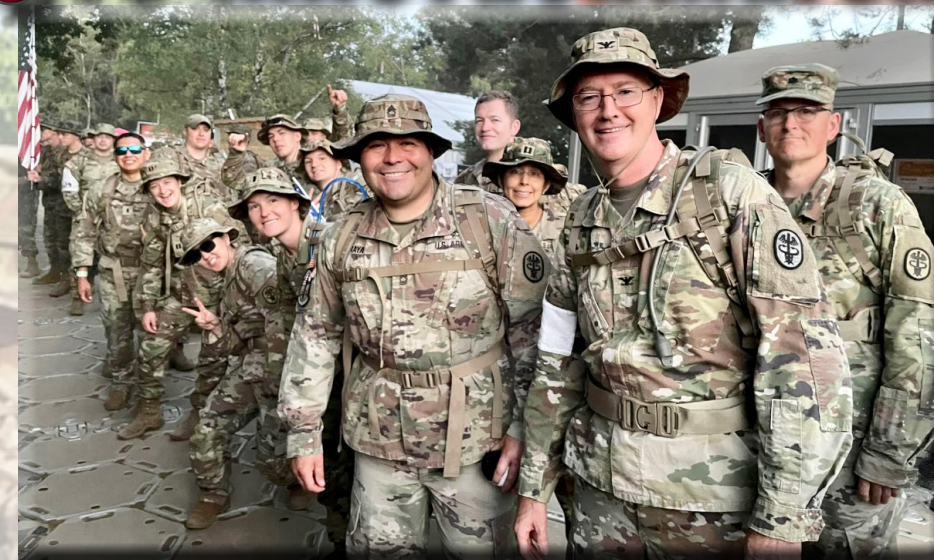
Members of Landstuhl Regional Medical Center take a photograph during the annual De 4Daagse (International Four Day Marches Nijmegen), this summer.

individual's colleague mentioned they hadn't ate much following the ruck march, indicating a possible case of low blood sugar.