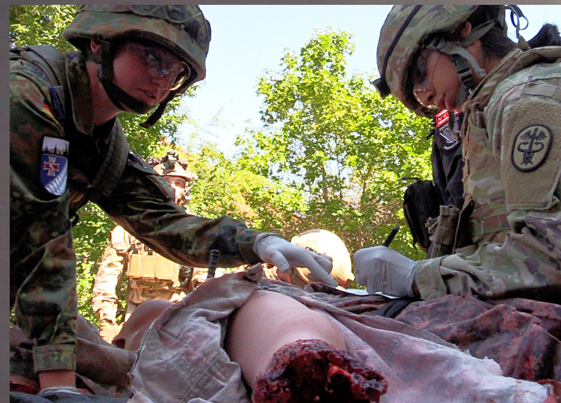
A Polish paramedic (left) and U.S. Army combat medic assess a simulated casualty during the International Trauma Combat Casualty Care (ITC3) course at Landstuhl Regional Medical Center, Aug. 11. The ITC3 course, which included nearly 30 Service Members from five nations, offered unit-level healthcare providers life-saving instruction to increase survivability at the point of injury and standardize battlefield care.