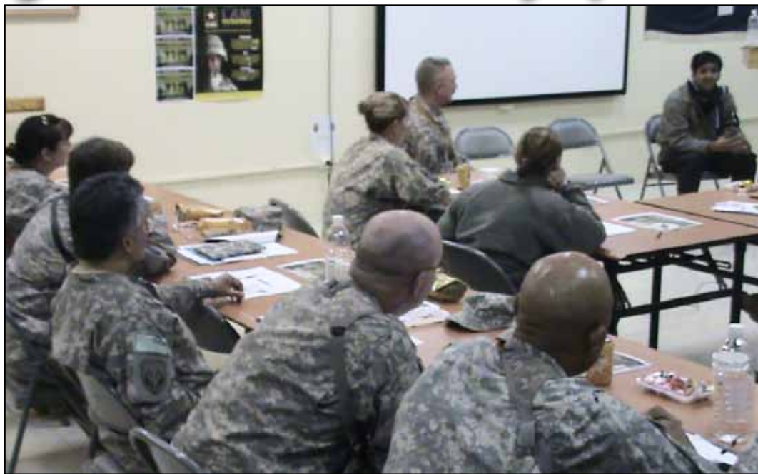
A Pakistani contractor explains the differences between his culture and American culture during the first day of the EO/ SHARP (Equal Opportunity/Sexual Harassment Assault and Response Program) symposium at the 49th MP Brigade chapel Dec. 17, Camp Liberty, Iraq.