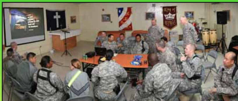
Soldiers from the headquarters company relax in the evening Jan. 28 by playing a DVD/ board game. Three teams from many sections and ranks competed in the morale-building activity.

CAMP LIBERTY, Iraq. -- The Sentinel's Chapel was once again the center of an evening morale building event for more than 20 Soldiers from the 49th Military Police Brigade Jan. 28 here.