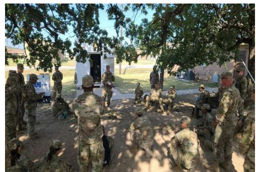
To learning about CLS and 9-line to save a life

Collectively the Soldiers of the Water Platoon worked tirelessly through the hot days in Texas. They continued to persevere through their challenges together, coming from the junior enlisted to their higher chain of command. Nothing can stop them at this point.