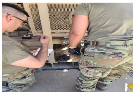
Coagulating bad bacteria to the process of purifying