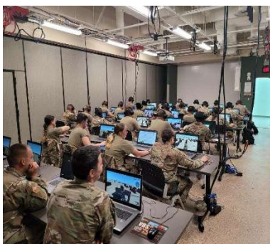
No experience to being the TC leading a convoy online offline.