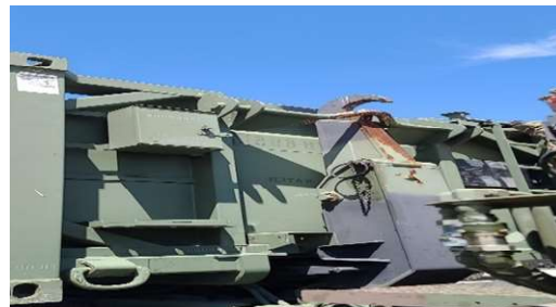
Hooking Hippo’s/Drivers training