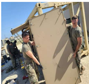
Taking doors of the hinges