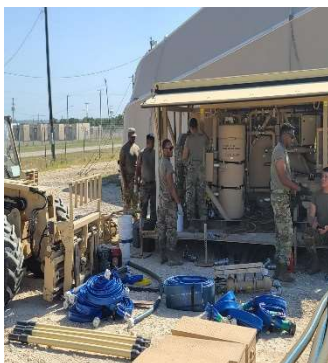
Finally receiving a TWPS