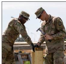
Resolute Castle in full swing ( News Link )