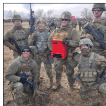
Sappers named King of the Castle ( News Link )