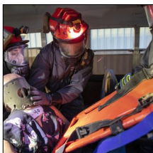
409th Engineers work Guardian Response 22 ( News Link )