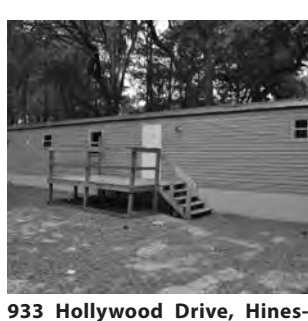
ville, GA 31313 Price reduced $74,900

YOU DO NOT WANT TO MISS OUT ON THIS BEAUTIFUL, SE-RENE LOT featuring a 3 bedroom, 2 bathroom remodeled mobile home and a huge pond with dock access! A cozy mobile home features a spacious living room and upgraded kitchen appliances, an enclosed porch, a covered open porch, and a chain-link fenced-in backyard! Backyard has a woodshed, metal shed, AND a chicken coop! Around the pond, you will find lots of natural beauty, and your summer days will feature long walks along the walkways and summer nights out on the dock! This 5.48-acre property is zoned AR1 for Agricultural/Residential, and with such a tranquil atmosphere, it will not last long! Another single-wide mobile home sits on the site, which could be used for investment income!!!