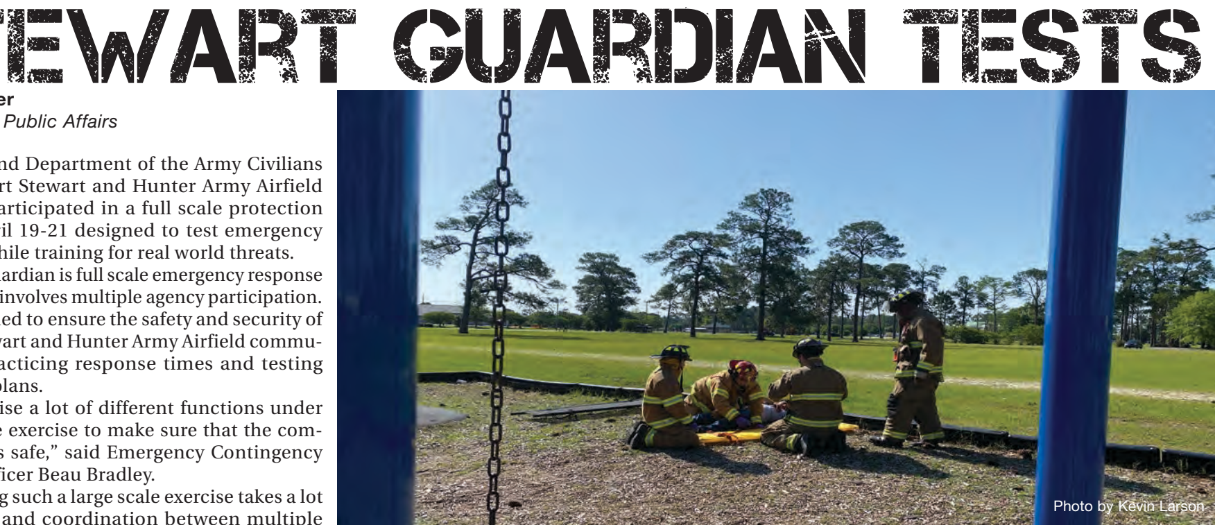
Fort Stewart firefighters treat a role-player "casualty" at the Army-Community Service play ground near the Exchange during Stewart Guardian April 20. The exercise practiced the inst tion's emergency response and recovery capability.

The installations' next full-scale exercise is in December and it will be externally evaluated by a team from U.S. Army Installation Management Command. Follow the Fort Stewart and Hunter Army Airfield digital media platforms for more information about the installations' exercise programs.