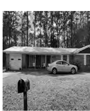
302 Floyd Street, Hinesville, GA 31313 $169,900

at 912-977-4733 cell or Jimmy. shanken@theshankenteam.com