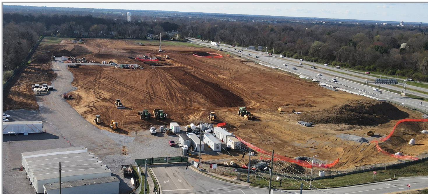
Walsh Turner Joint Venture II