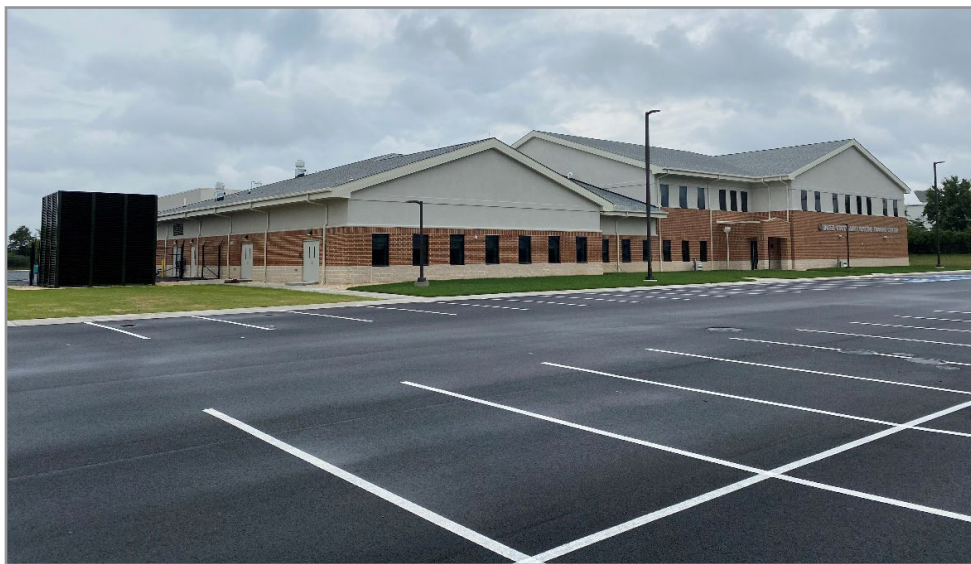
The U.S. Army Corps of Engineers Louisville District completed a new 43,000 square-foot Army Reserve Center in Newark, Delaware, which supports the training and mobilization of 300 reservists in 11 units.

The facility was fully troop ready in January 2022.