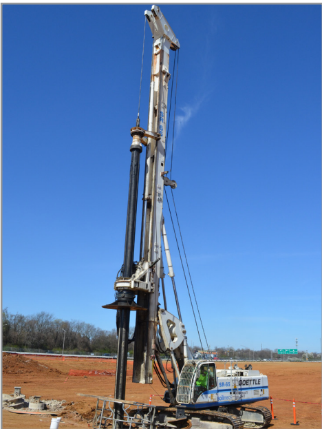
A contractor uses a drill rig to remove soil overburden March 28. The drill rig is also being used to remove bedrock as part of forming drilled piers.

To learn more about the project visit: www.va.gov/louisville-health-care/programs/new-robley-rex-va-medical-center .