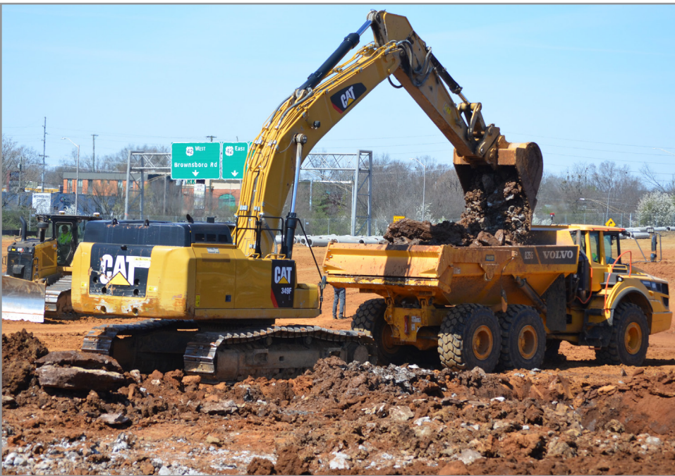
Earthwork is one of the main activities that has taken place on the site up to this point to sculpt the site in preparation for upcoming structure construction activities.