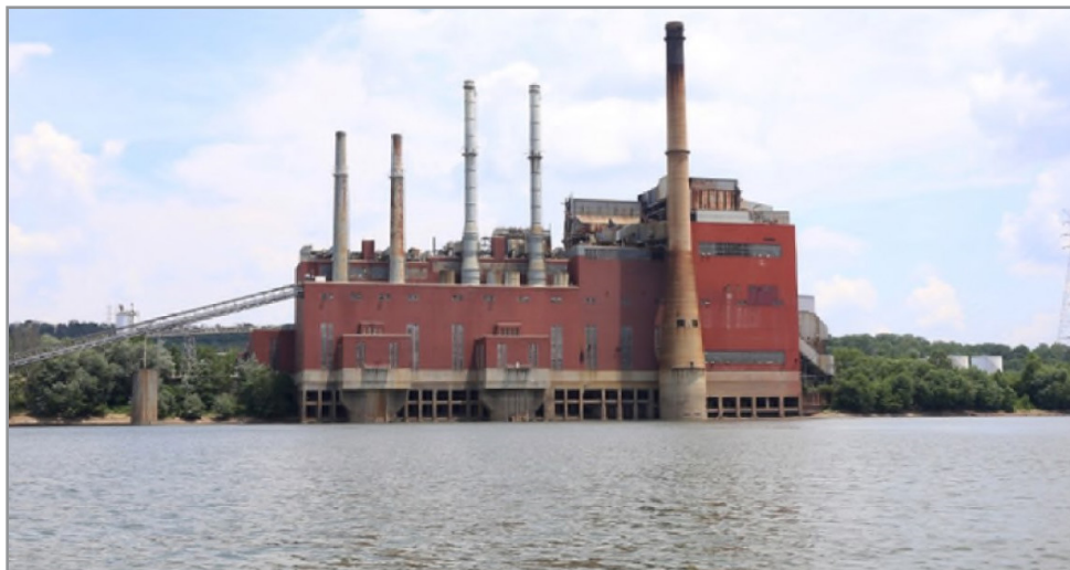
The Walter C. Beckjord Generating Station was a 1.43-gigawatt, dual-fuel power generating facility located in New Richmond, Ohio.

recreational boating during the marine salvage operation.”