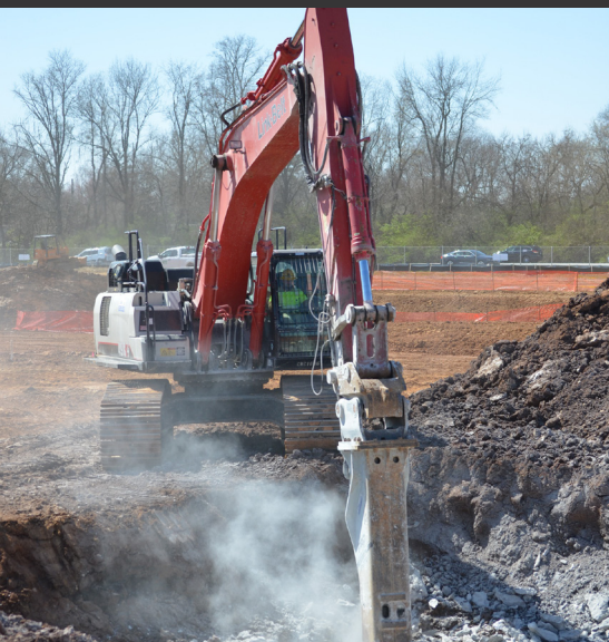
A contractor uses a hoe ram to break up bedrock in the basement area of the future Louisville VA Medical Center March 28.

Falls City Engineer is an unofficial publication under AR 360-1, published bimonthly for Louisville District employees and members of the public by the U.S. Army Corps of Engineers, CELRL-PA, P.O. Box 59, Louisville, Ky. 40201-0059 under supervision of the Public Affairs Office. Views and opinions expressed are not necessarily those of the Department of the Army or the Corps of Engineers.