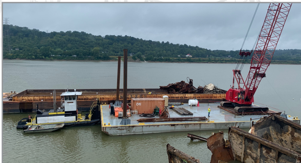
Contractors remove debris after a smokestack, associated with the demolition of the former Beckjord Generating Station toppled into the Ohio River in New Richmond, Ohio.

USACE Louisville District Regulatory staff conducted a site visit to the Beckjord Generation Plant to confirm that the Department of Army permit non-compliance issues were fully resolved, and USACE determined the permittee had successfully resolved the noncompliance issues, resulting in the enforcement action being closed.