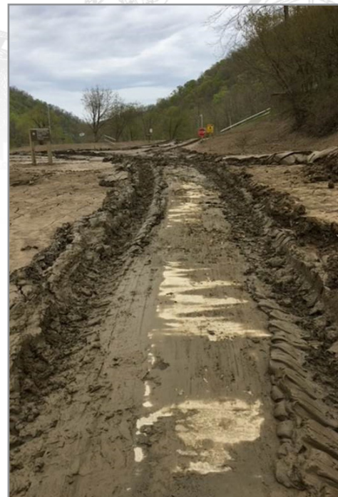
Spring flooding at Buckhorn Lake leaves behind significant debris and mud around the project site, which must be cleaned up each year.