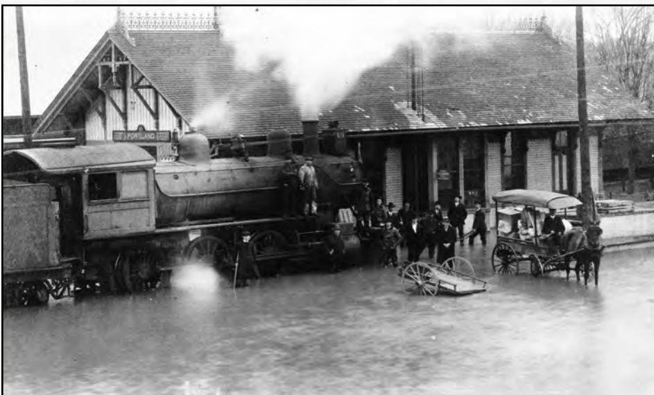
Portland, Ind., on the Wabash River in Fountain County, was one of the many communities affected by the Great Flood of 1913.

One hundred years ago, heavy rains came to the Ohio Valley bringing floods that washed away roads, homes and businesses. Hundreds died as a result and thousands were left homeless. Reaction to the disaster—at the time one of the worst in United States history—helped bring about many of the federal, state and local flood prevention and education efforts in use today.