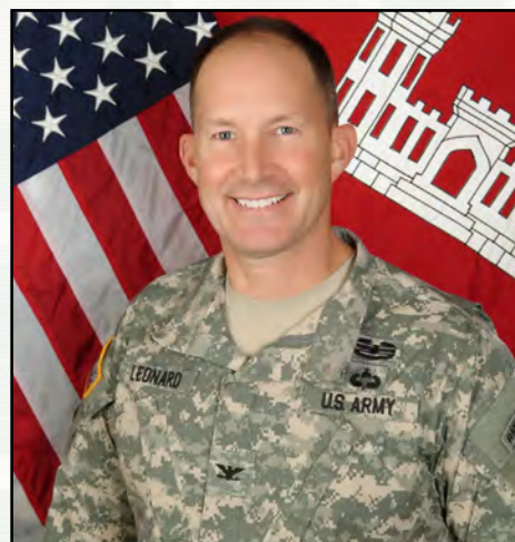
Col. Luke T. Leonard Commander and District Engineer Louisville District U.S. Army Corps of Engineers

By Sept. 23, 2013, all furloughed employees will return to their normal work schedules. If a budget resolution or other action eliminates the need for furlough sooner, the process could be halted at an earlier date.