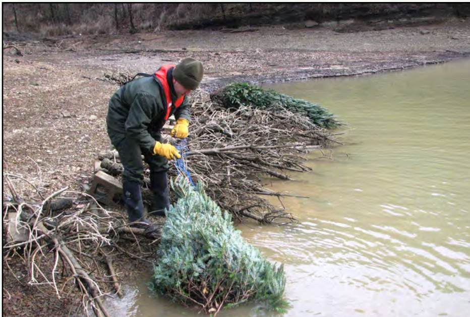
Dakota Kendall, Carr Creek Lake ranger, ties old Christmas trees together. The trees will be placed in the lake to attract fish.