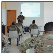
Sponsorship Program at work ( News Link )