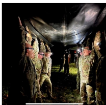
Sapper Leader Course graduates ( News Link )