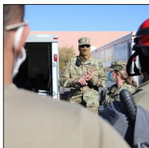
409th EVCC preps for worst case scenario ( News Link )