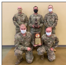
409th Engineers earn SEA Award ( News Link )