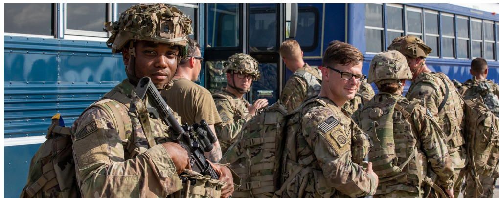
Deployment Cycle Resilience Training prepares Soldiers, leaders, and Families for challenges at each stage of the deployment cycle. ARD enacted the revised DCRT curriculum in 2021. The training now aims to enhance resilience and well-being of Soldiers and Families by strengthening personal relationships, unit cohesion, and increasing mission effectiveness.

The second theme is a greater emphasis on growth and the positive gains from employing resilience skills and strategies. The DCRT modules encourage Soldiers and Circle of Support members to see how the deployment cycle challenges can lead to personal, professional, and relational growth for