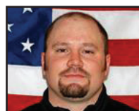
Steve Holcomb, former Soldier