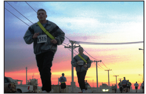
Soldiers with 4IBCT, 1st Inf. Div., participate in the Sexual Assault Prevention Run, at COB Speicher Feb. 12

Top Army leaders have been very vocal that when it comes to sexual harassment and assault, the Army has a "zero tolerance" policy.