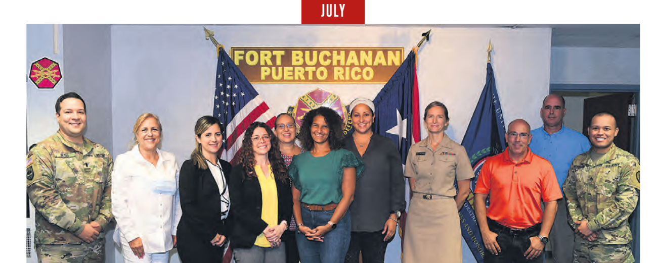
Fort Buchanan hosts Public Affairs Network Meeting