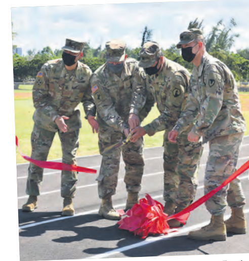
Ribbon Cutting Ceremony of Maxie Williams Track