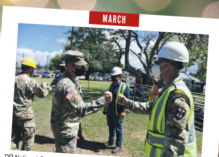
PR National Guard and Fort Buchanan work together in Las Casas Lake