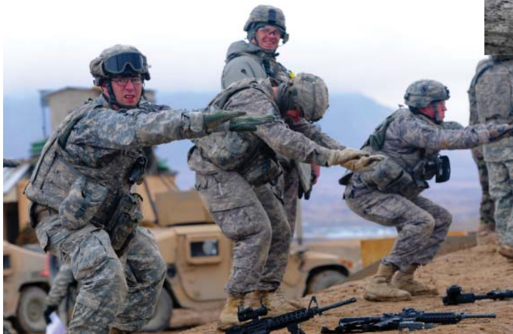
Competitors do deep knee bends during the stress shoot portion of the marksmanship competition of the Warrior and NCO of the Year competition held at Kabul Military Training Center.