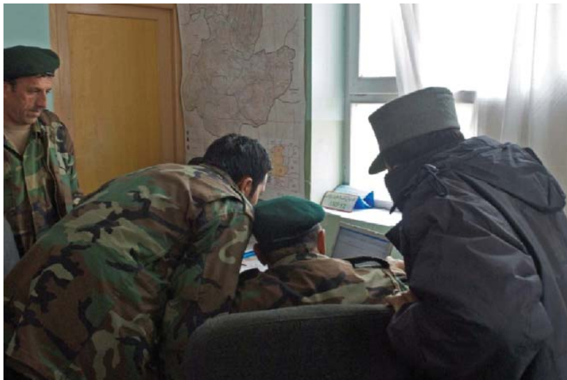
Afghan National Police and Afghan National Army soldiers huddle around an OCP computer as they review their inventories Dec. 9, 2009. The OCP is the core of the security element in the Sar-e Pol Province.

In addition to legitimately supplying the ANA and ANP's demand for more necessary equipment, OCP's logistical section has been able to streamline, organize and