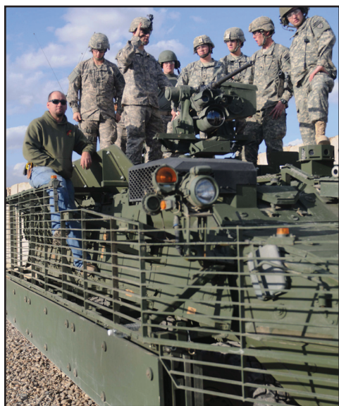
Soldiers of 3rd Plt., 66th MP Co., learn to calibrate the .50 caliber machine gun with its control system in the new full-spectrum effects package Stryker.

Modes of transportation and the transfer of information, have evolved over the past 10 years. Today, Soldiers, now have non-lethal capabilities to respond to demonstrations and