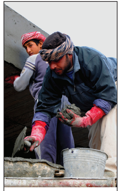
A worker with Brother Group Construction and Services gathers concrete to lay on the façade of a new school being built in Al Khanag village.

"More important than building schools is educating children," she said. "Anything we can do to give them the facilities and the means will give them a leg up. [The children] need to be educated here and contribute to the growth and success of this country."