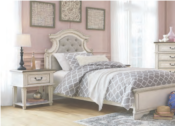
Twin Upholstered Bed Includes twin upholstered headboard footboard and rails. Additional matching pieces available.