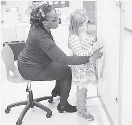
FORT CAMPBELL COURIER ARCHIVE

Fort Campbell schools have been recognized nationally through the U.S. Department of Education 2021 National Blue Ribbon Schools Program. In September, Andre Lucas Elementary