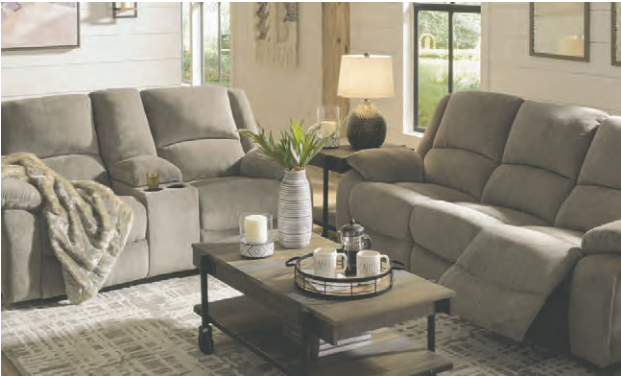
Reclining Sofa -or- Loveseat Choose between dual reclining sofa or dual reclining console loveseat