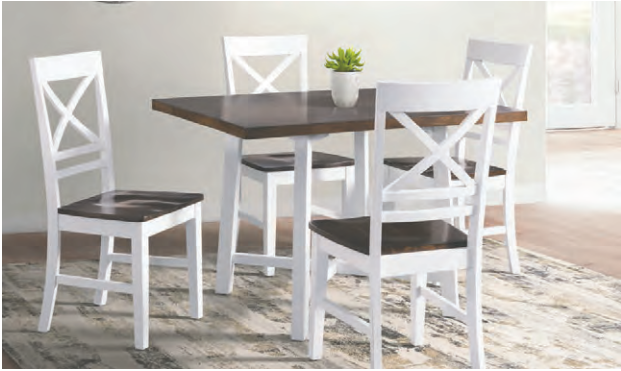
5 Pc. Dinette Includes dining table and 4 chairs. Also available in counter height.