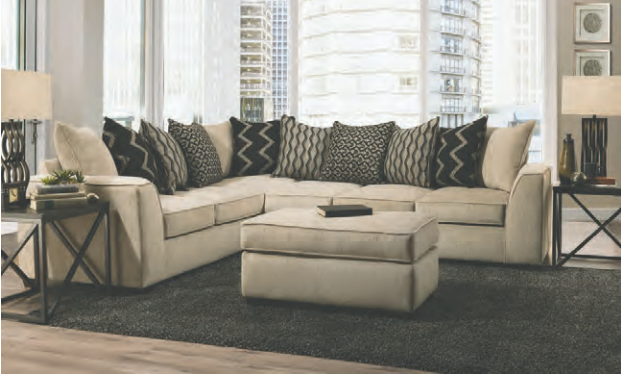
Oversized Sectional Features a contemporary design with lots of accent pillows!