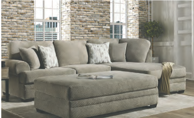
Oversized Chaise Sectional Accent pillows included While supplies last