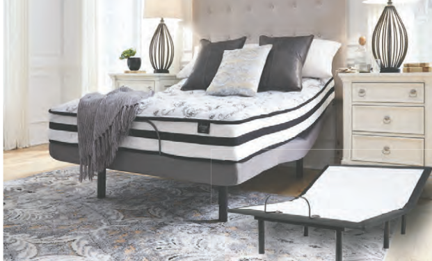
Queen Mattress PLUS Adjustable Base