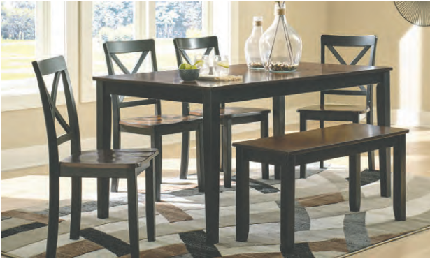
6 Pc. Dinette Includes standard height table, 4 padded chairs and a padded bench