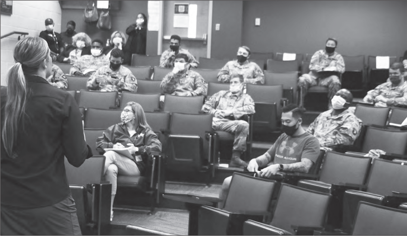
ETHAN STEINQUEST | FORT CAMPBELL COURIER

Applying for programs early is encouraged because spots fill up quickly; however the CSP staff also will assist veterans after they separate