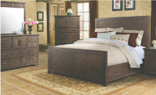
5 Pc. Queen Storage Bedroom Includes queen headboard footboard, storage rails, dresser and mirror. Also available in king