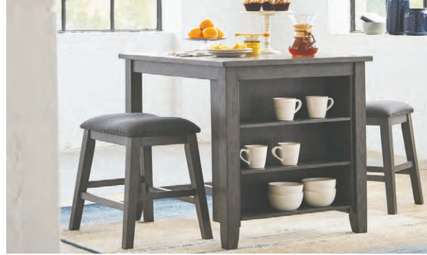
3 Pc. Dinette Includes counter height storage table and 2 padded stools.