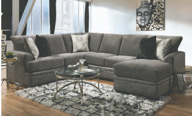
Chaise Sectional Switch between left or right side chaise. Additional matching pieces available.