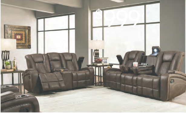
Reclining Sofa -or- Loveseat Sofa features pull down console with usb ports and LED lighting