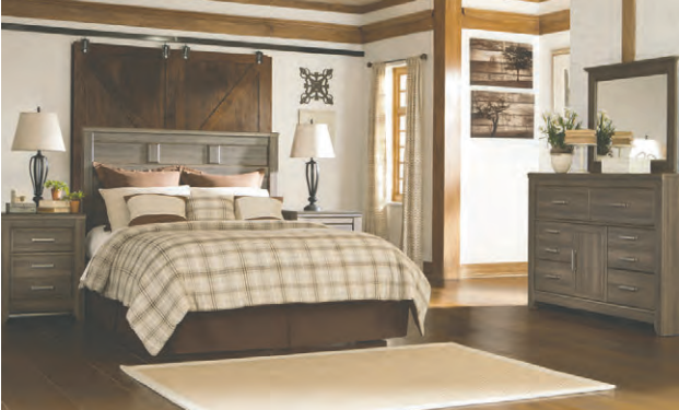
5 Pc. Queen Bedroom Includes queen headboard, dresser, and mirror. Additional matching pieces available. Also available in twin, full and king.