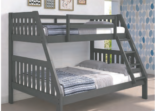
Twin/Full Bunk Also available in white. Guard rails and ladder included