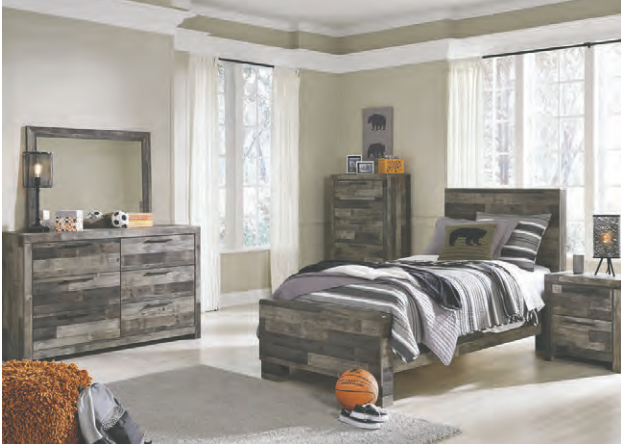
5 Pc. Twin Bedroom Includes twin headboard, footboard rails, dresser and mirror.