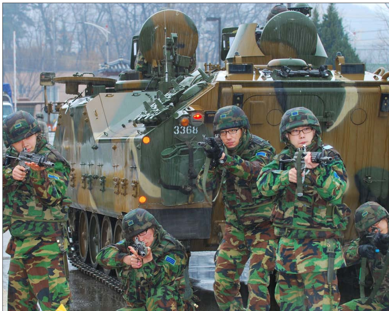
Republic of Korea Army Soldiers form behind an armored personnel carrier during a suspected gate breach as part of a force protection exercise held March 29 to April 1 at K-16 Air Base.