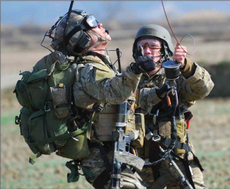
지난 4월 8일 캠프 워커 근처 호숫가에서 2-2전투항공여단 소속 장병이 다친 공군 소속 장병을 급히 후송하여 응급처치를 하는 훈련을 진행하고 있다.

<기사 _상병 마주호 / 2nd CAB Public Affairs>