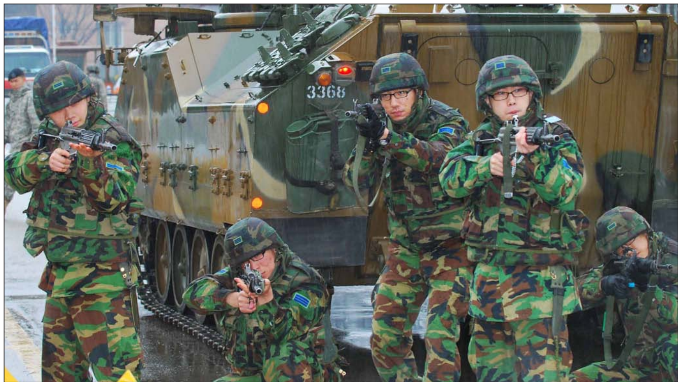
지난 3월 31일 한국군 장병들이 K-16 공군기지 출입문에서 생긴 비상 상황에 대비한 훈련을 받고 있다.

3월 29일에서 4월 1일까지 K-16 공군기지 (Air Base) 에서 미군과 한국군 장병들이 춥고 비오는 날씨에도 불구하고 테러 위협을 대처하는 방법을 배우기 위해 훈련에 참여했다. 이 방어 훈련에는 2 전투항공여단, 제 15 혼성비행단, 제 718 폭발처리중대, 그리고 기지내 소방서 직원들을 포