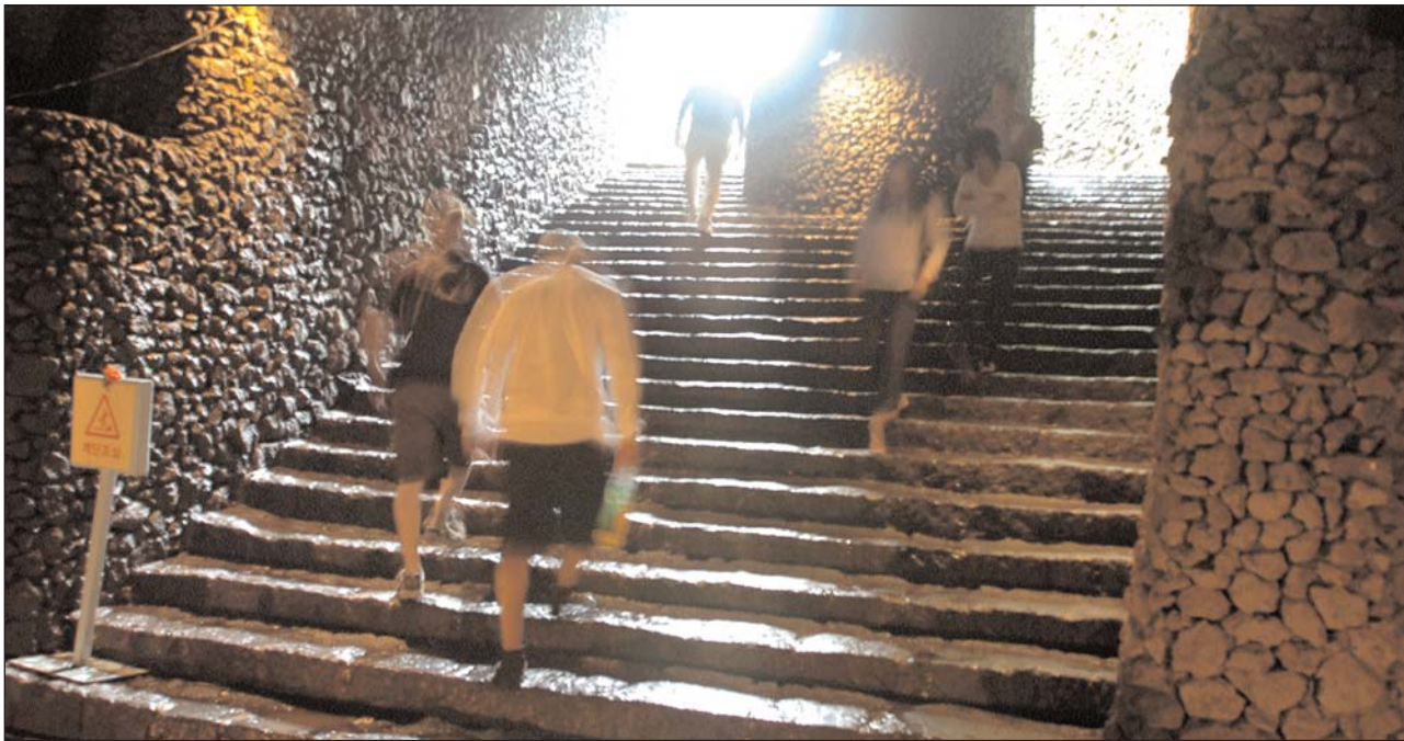
Soldiers of 2ID climb the steps out of a volcanic cave on Jeju Island June 22.