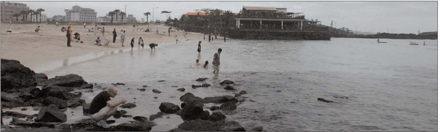
Soldiers of 2ID enjoy a white-sand beach of Jeju Island June 22.