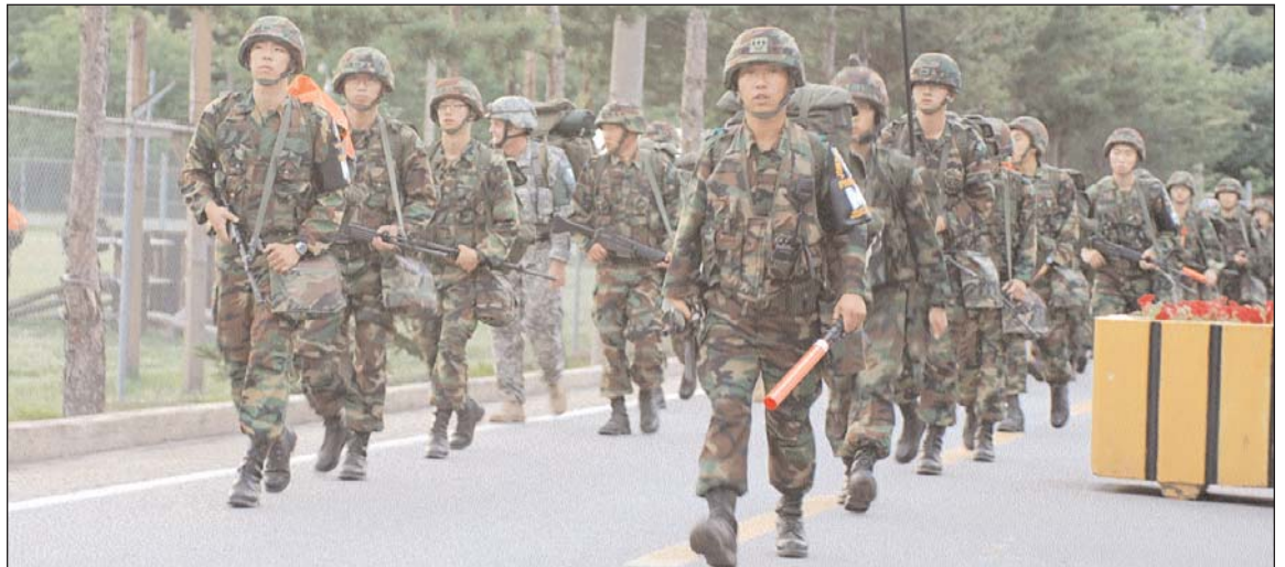
Soldiers from the HHC, UNC Security Battalion at JSA are returning from their 5-mile Korean War commemorative rucksack march at Camp Bonifas 25 June. The Korean War broke out in the early hours of June 25, 1950 with north Korea invading South Korea by crossing the 38th parallel.

In addition to the commemoration, the foot march provided an opportunity to build a bond between ROK and U.S. Soldiers. The commander from both the ROK and U.S. were keen to speak with the Soldiers and develop a relationship with