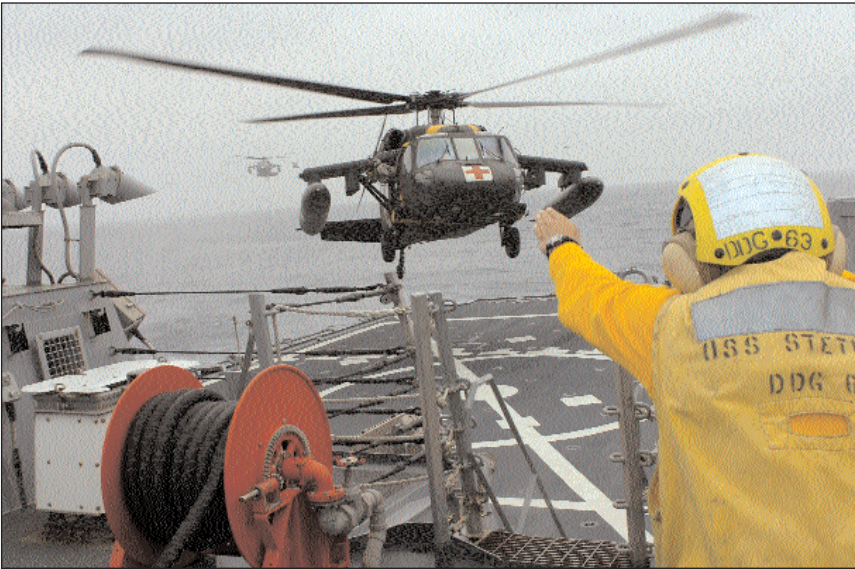
An aircraft handling officer guides a Blackhawk to the landing zone on the stern of the USS Stethem during qualifying exercises in the Yellow Sea, June 17.

Weather was also a factor as thick, grey clouds remaining from the previous night's rain, along with a variable sea state, made the mission more dif-