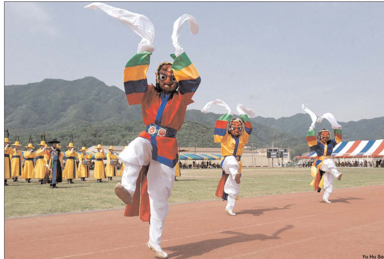
Traditional Korean dancers, known as Taichum, entertain during the closing ceremony.