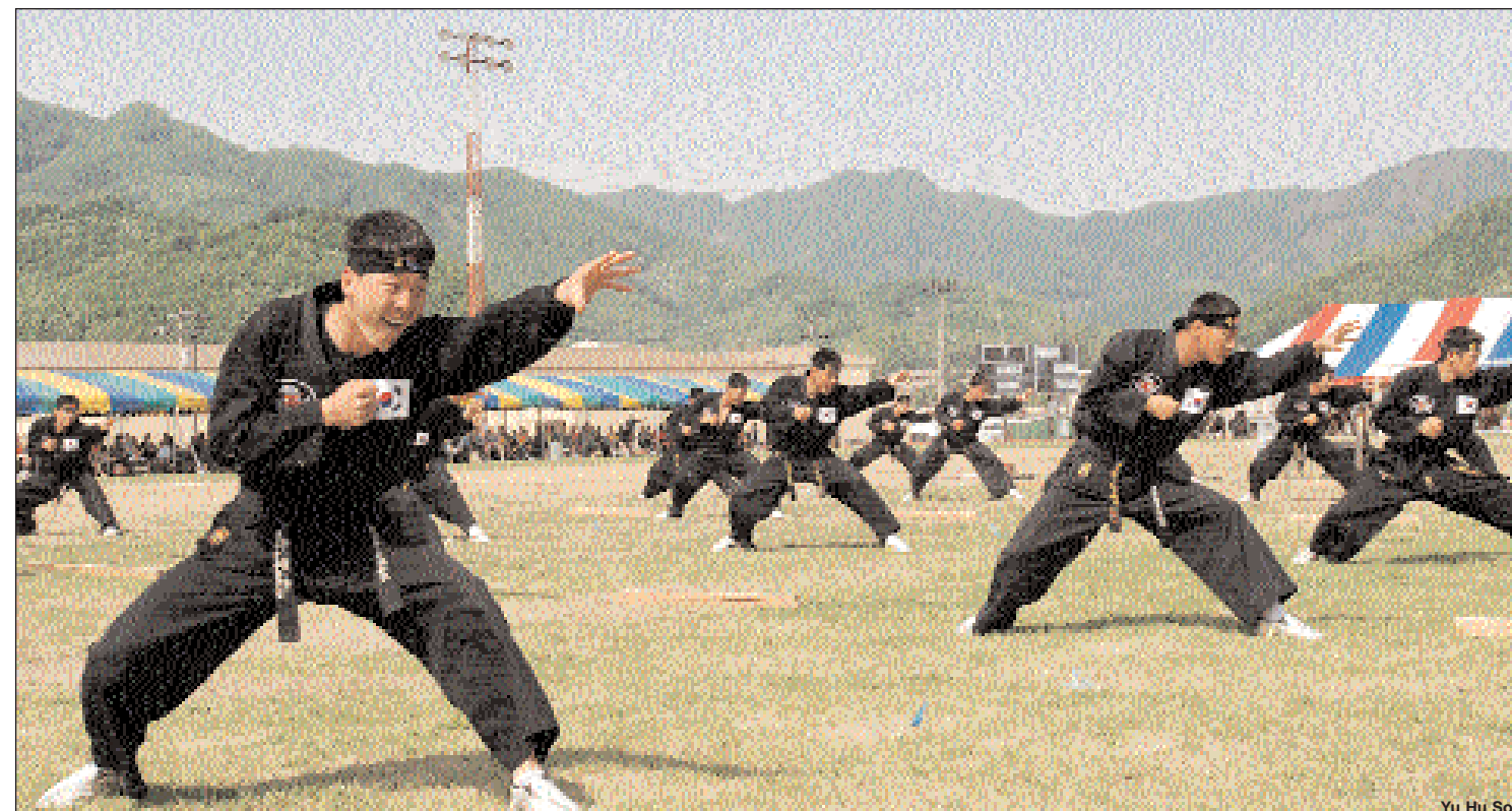
The Republic of Korea Special Forces martial arts team performs during the closing ceremony.