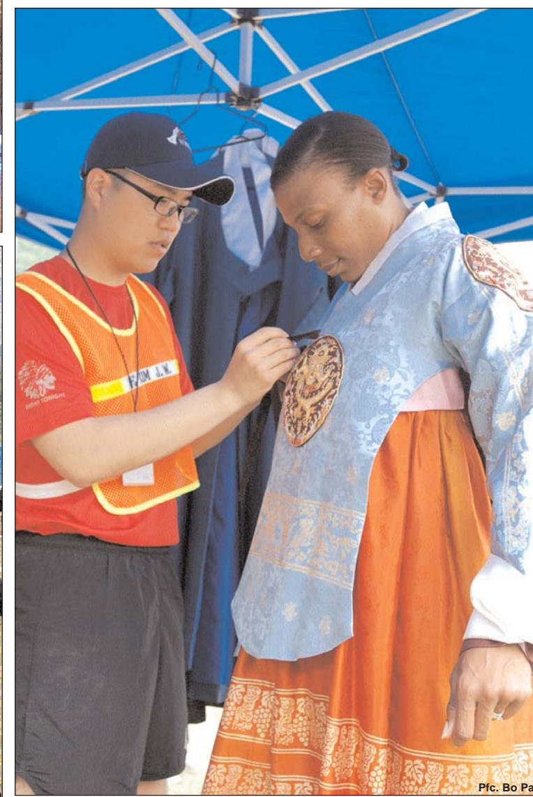
A KATUSA dresses a Soldier in hanbok, a Korean traditional dress.