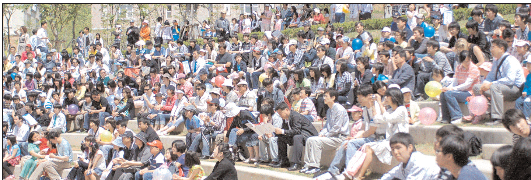
The concert audience included students and teachers from the English Village as well as Families who had a day out on Children's day.