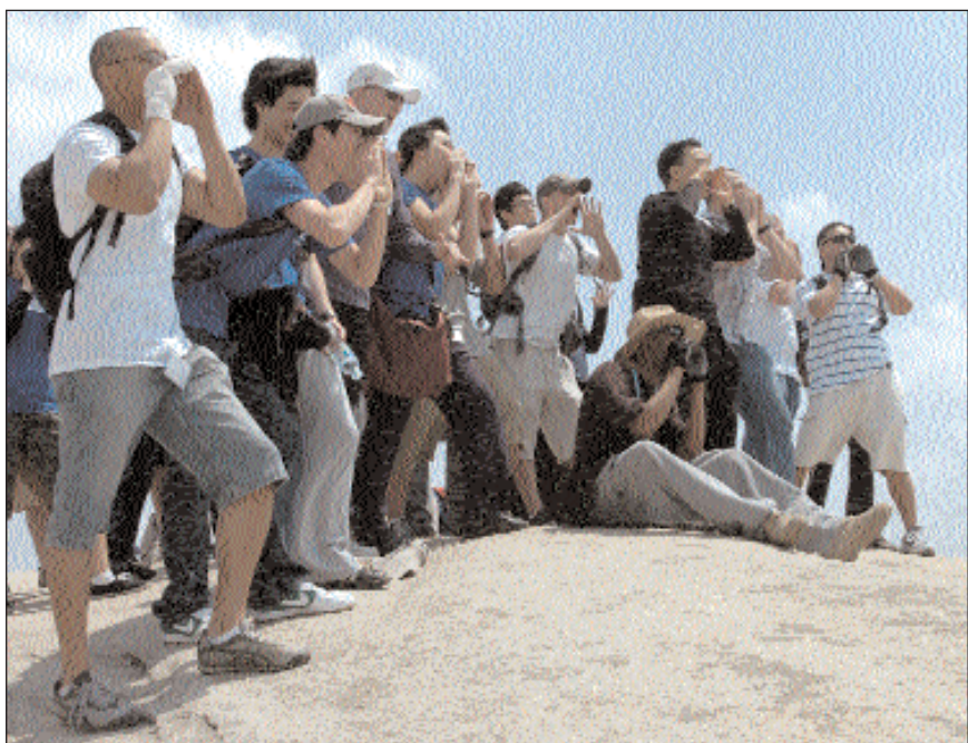
2ID Soldiers and students yell together from the top of Sa-Pae Mountain during the 2008 One-Mind Hiking Trip May 1.