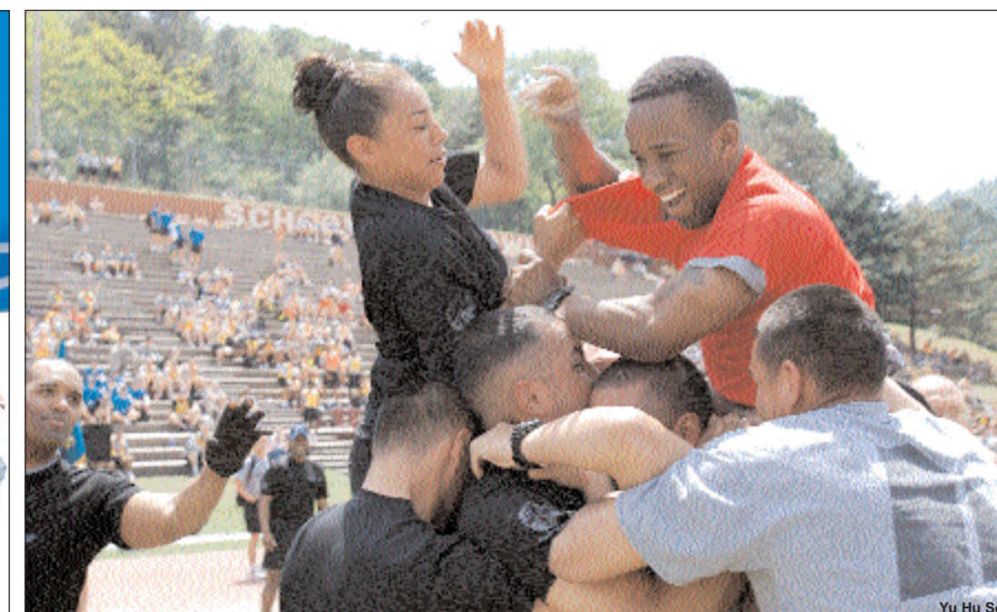
Soldiers do battle in a match of Kimajun during the 21D finals.