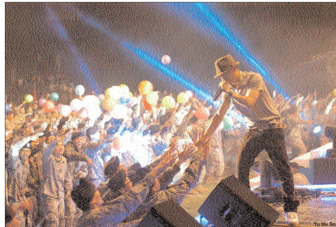
Dynamic Duo performs for the crowd during the MND Concert.