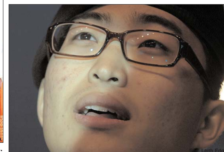
A KATUSA takes in the sights and sounds of the MND Concert.