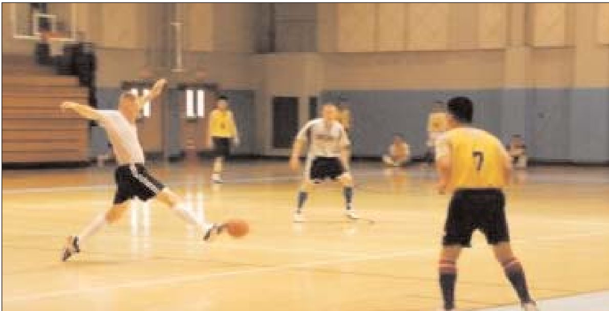
Two teams from Casey and Hovey will represent Area I in the 2007 8th Army Indoor Soccer tournament.