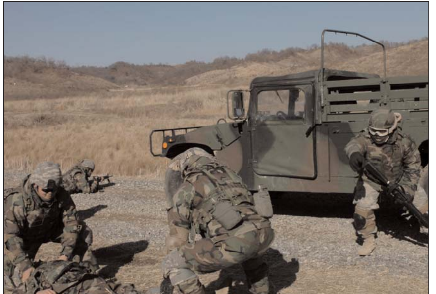
Junior-enlisted Soldiers who were charged as squad leaders during the exercise, issued commands to others.