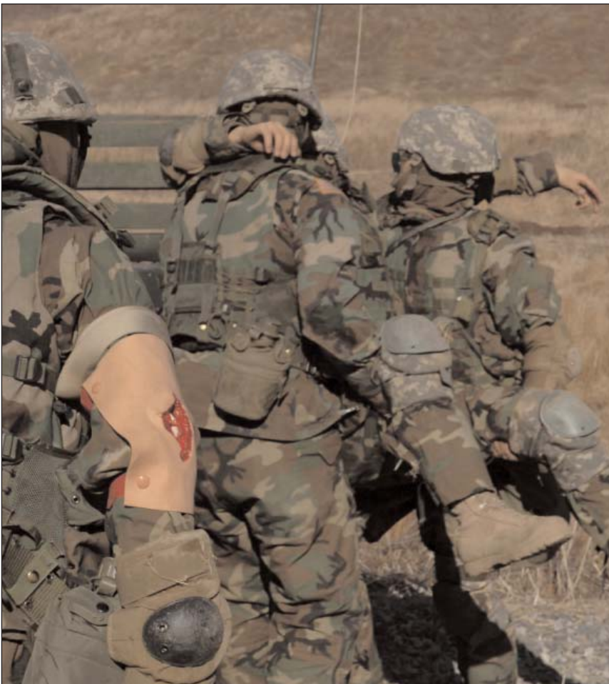
Soldiers place a simulated casualty onto the back of a HMMWV for a medical evacuation. Soldiers not only had to defend the convoy, but also care for wounded.