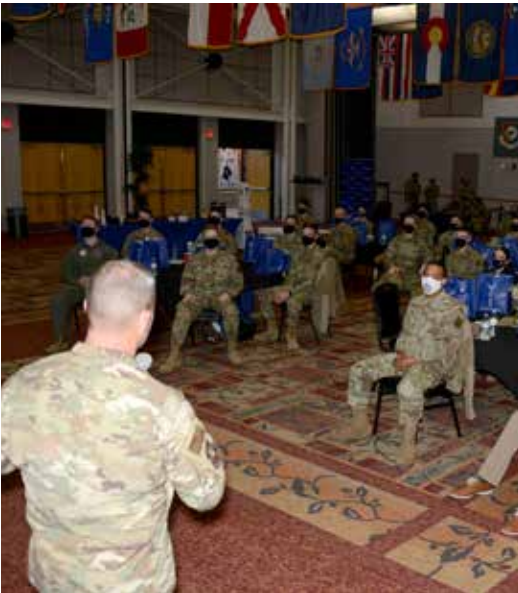
The 931st Air Refueling Wing hosted a recruiting event for a group of 352nd Recruiting Squadron recruiters to highlight the mission, local community and the need for more people at the unit.