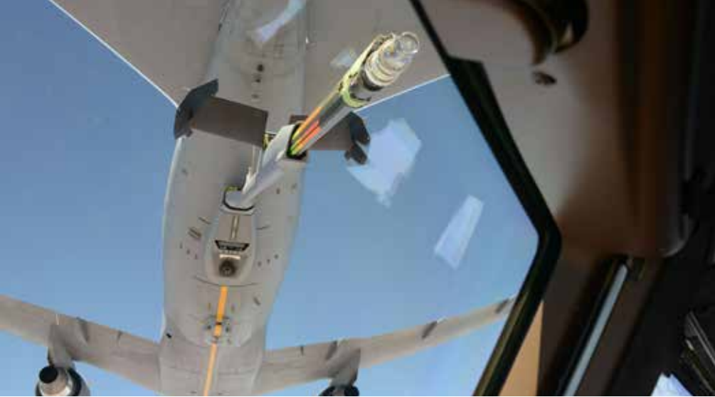
A KC-46 Pegasus lowers the boom to refuel another KC-46 as part of a recruiting event hosted by the 931st Air Refueling Wing.

“With the advent of the new weapon system, there are more than 300 newly added positions to support our expanding