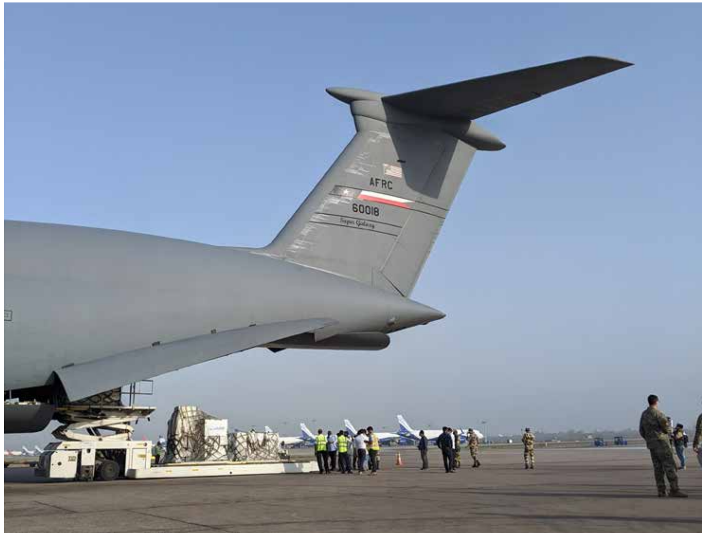
Ground crews offload COVID-19 medical treatment supplies from a 433rd Airlift Wing C-5M Super Galaxy May 4, at the airport in New Delhi, India. Multiple U.S. Air Force aircraft moved the supplies from Travis Air Force Base, California.