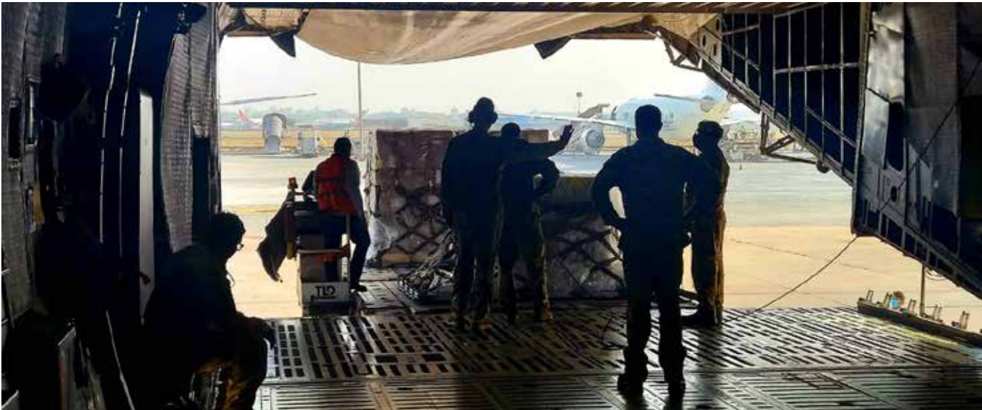
433rd Airlift Wing Reserve Citizen Airmen work with ground crews at the airport in New Delhi, India, to offload COVID-19 medical treatment supplies from a U.S. Air Force C-5M Super Galaxy.

#ReserveReady (Wade is assigned to the 433rd AW public affairs office.)