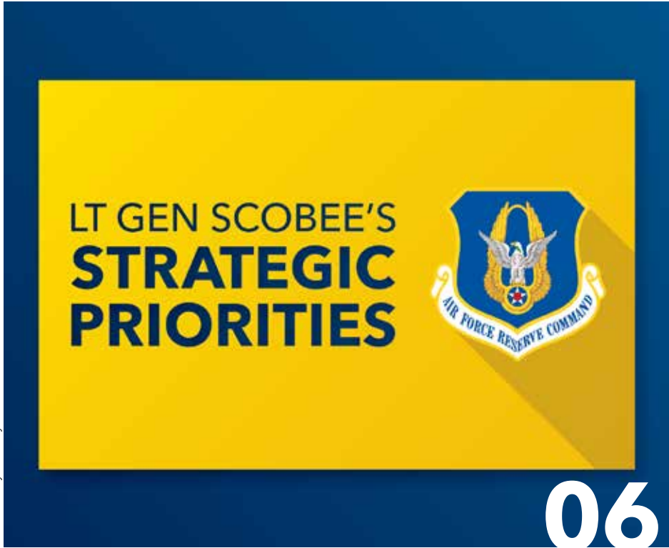
Table of FEATURED STORIES