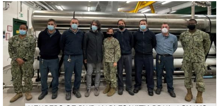
MEMBERS OF PWD NAPLES WITH RDML AGUAYO