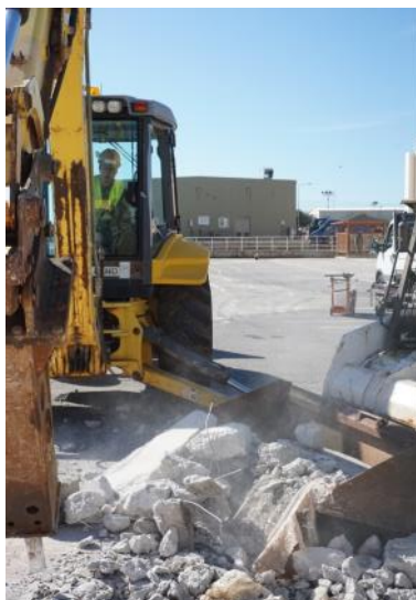
EOCN Noah Sexton, Souda Bay