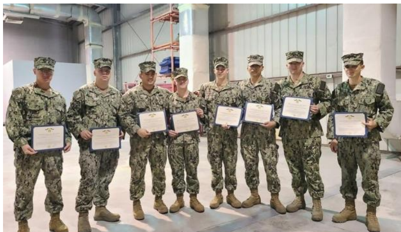
AWARDEES AT PWD BAHRAIN