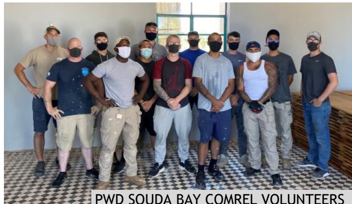
PWD SOUDA BAY COMREL VOLUNTEERS