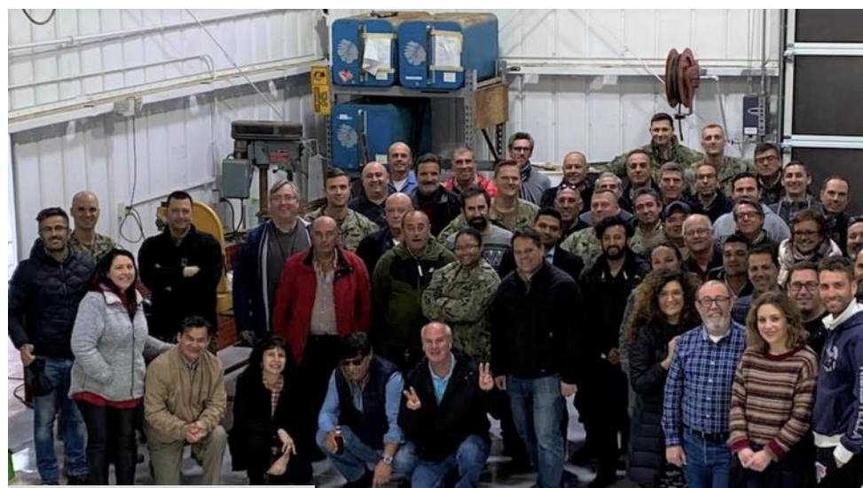
MEMBERS OF PWD ROTA