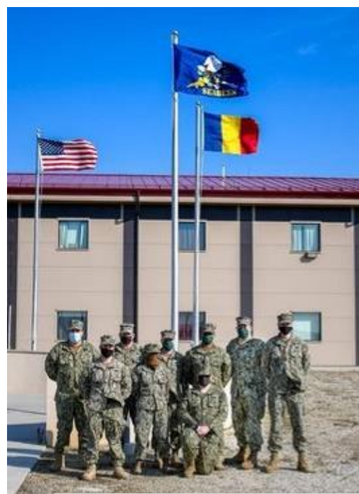
MEMBERS OF PWD DEVESELU