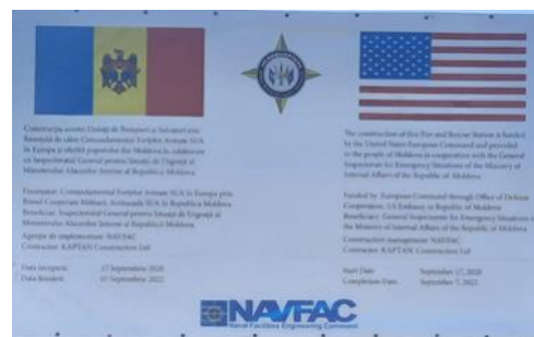
Humanitarian Assistance Project in Moldova