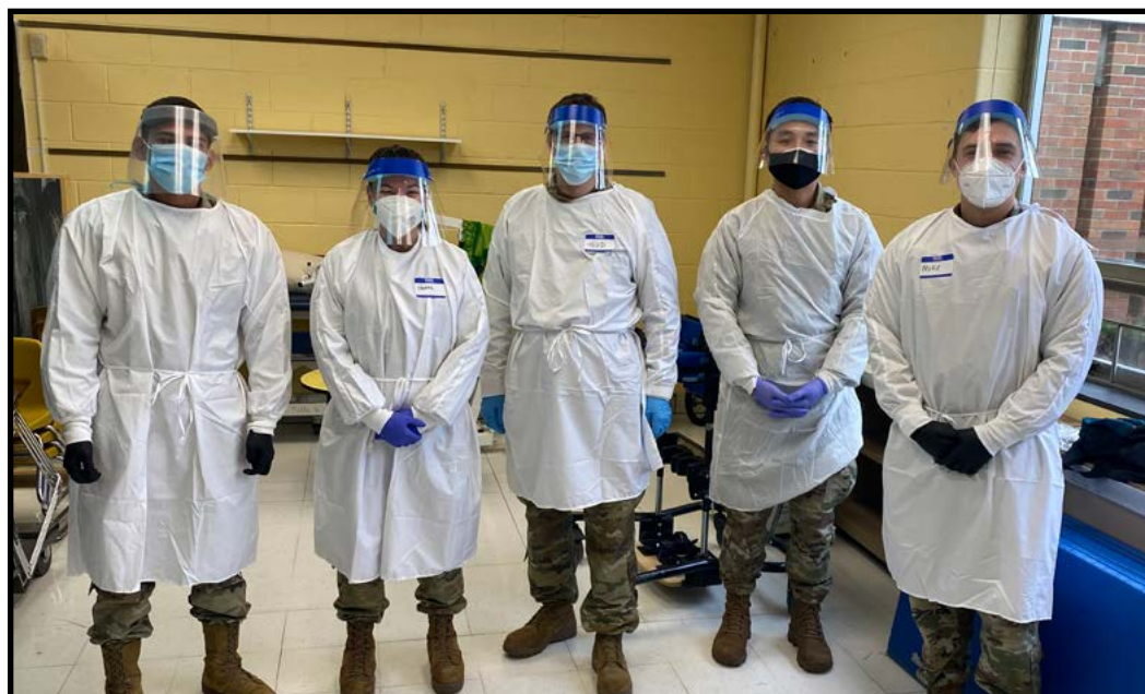
Supporting schools with COVID-19 Tests

View all Command Media, news, Air Scoops and more on the Air Force Connect Mobile App. Add the 104th Fighter Wing to your favorites. Available on the Apple App Store and Google Play Store