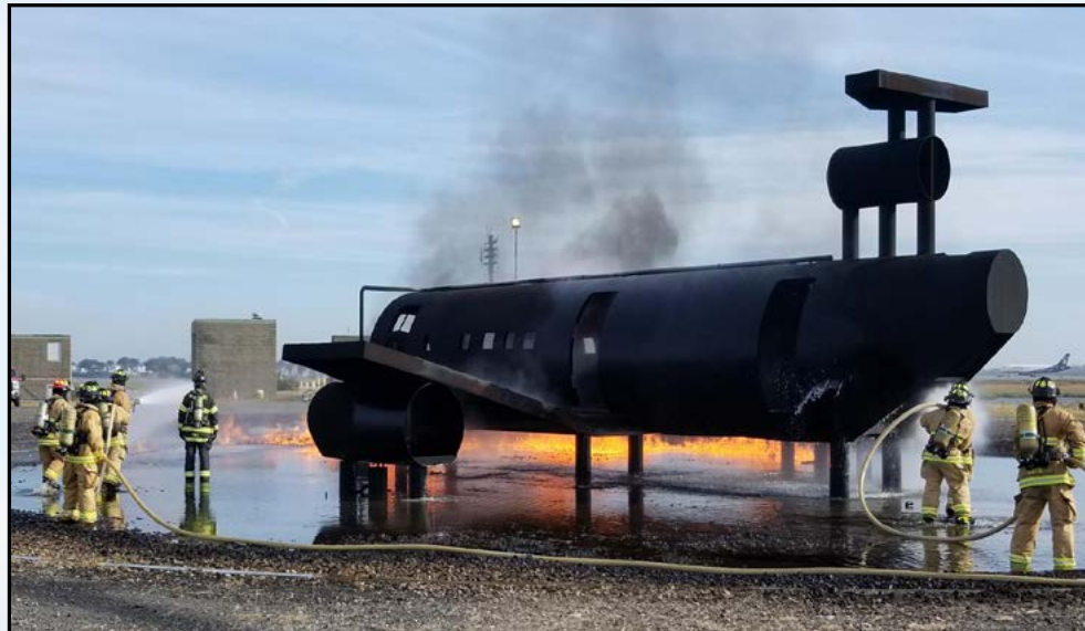
Firefighters train for aircraft burns