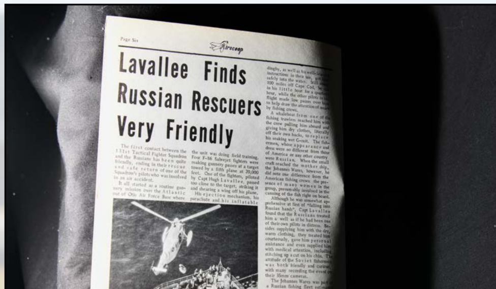
Honoring Capt. Hugh Lavallee