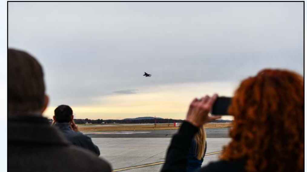
Chamber of Commerce tour