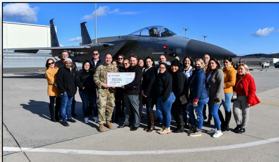
Gallagher Real Estate base tour