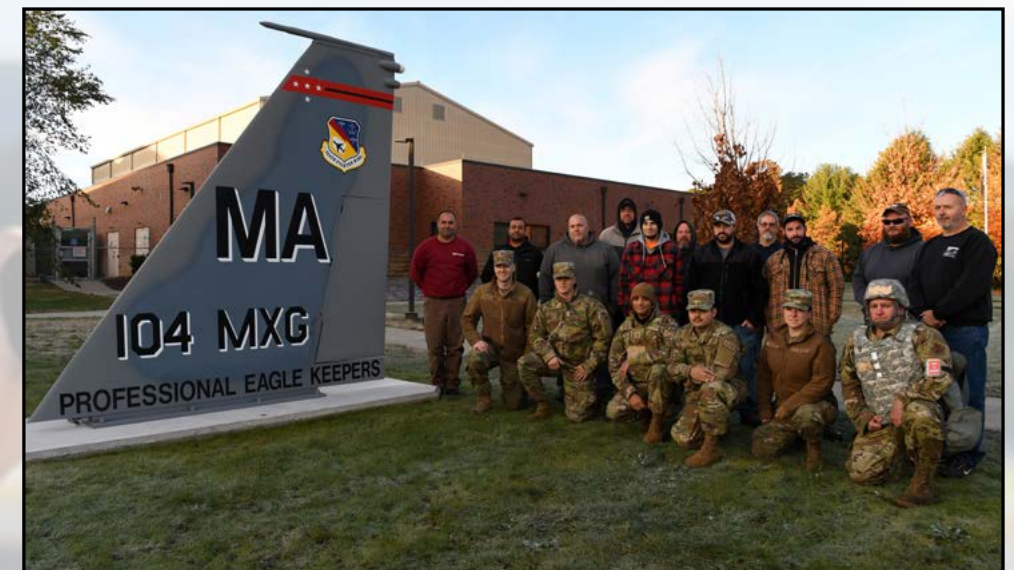
New F-15 Eagle tail static display