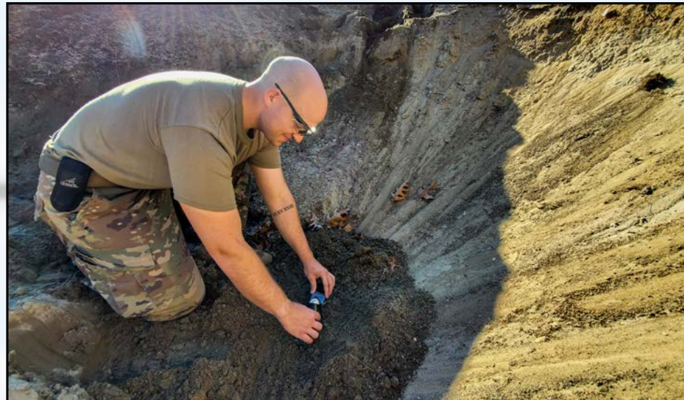
EOD assists NH State Police