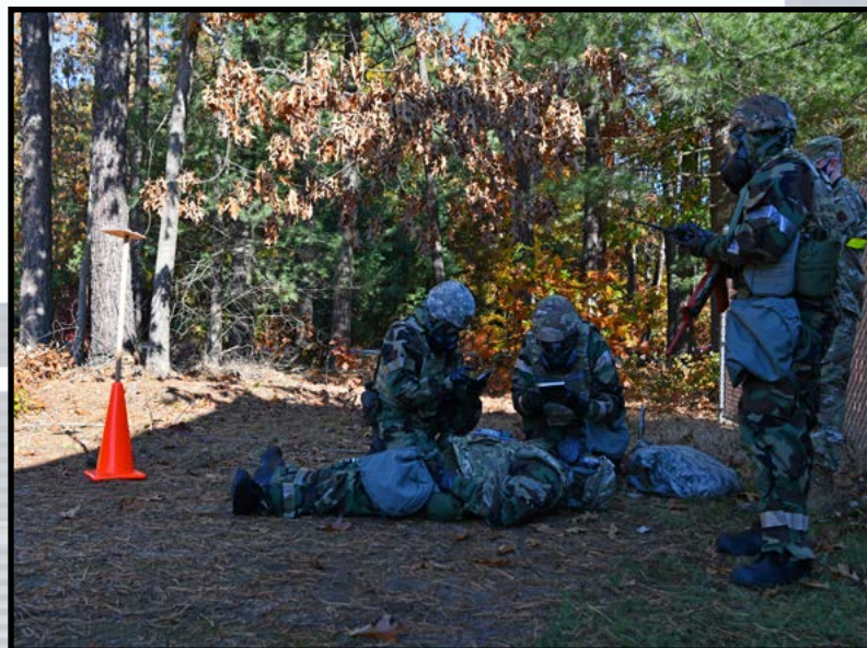
104th Communications Flight Airmen respond to an exercise scenario while on a Post-Attack Reconnaissance team sweep during a midpoint inspection readiness exercise November 6, 2021 at Barnes Air National Guard Base, Massachusetts. Midpoint inspections are conducted to evaluate the wing's capabilities to respond to threats in a contested, degraded, and operationally limited environment.