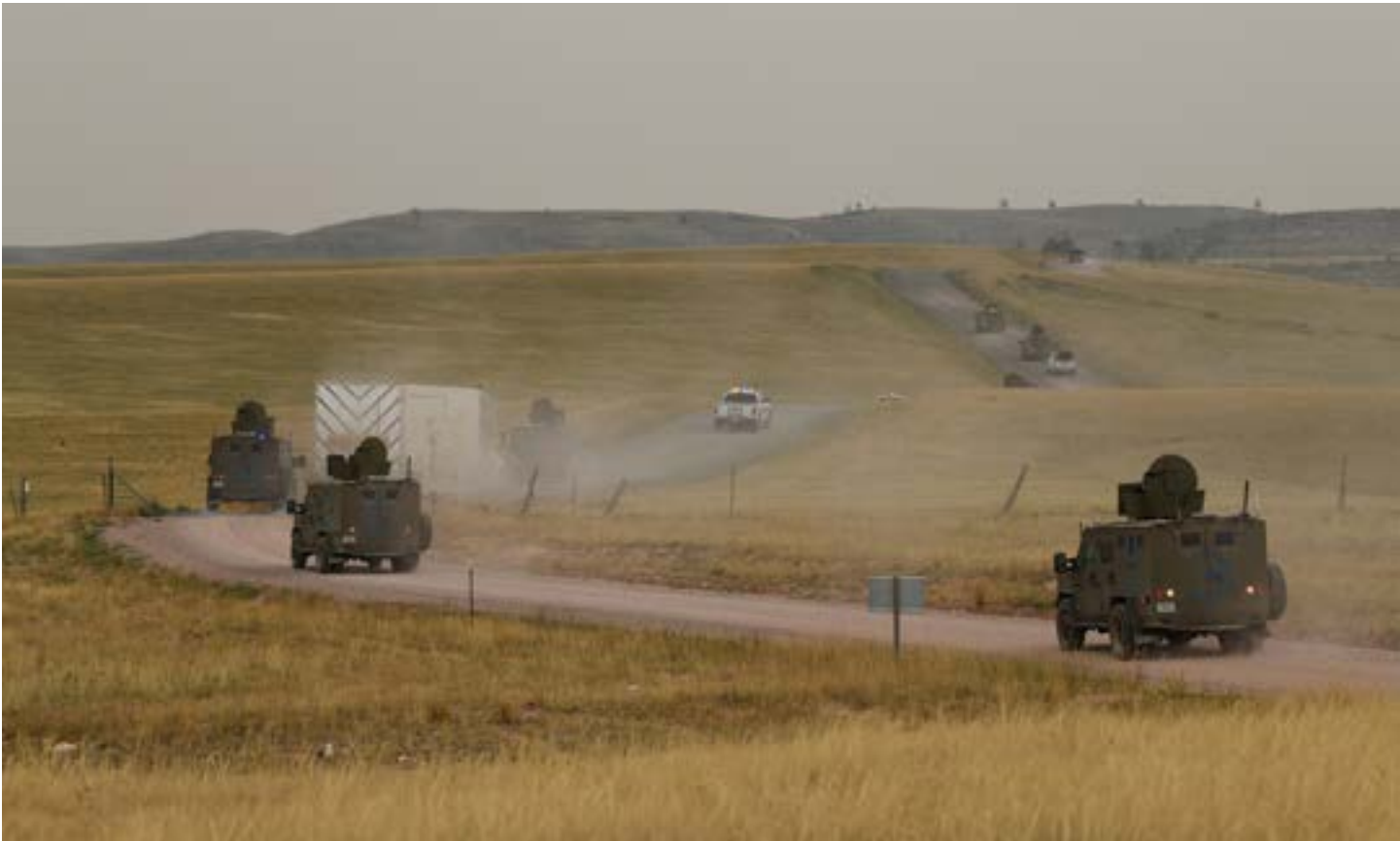
Above: Defenders assigned to the 90th Security Forces Group defend against an oppositional force during operation Road Warrior, Camp Guernsey, Wyoming, Aug. 18, 2021. Operation Road Warrior is a 20th Air Force training exercise that assesses nuclear convoy operations which are regularly conducted by security forces, maintenance and helicopter groups. A convoy consists of a group of military vehicles secured by trained defenders which transports nuclear components.