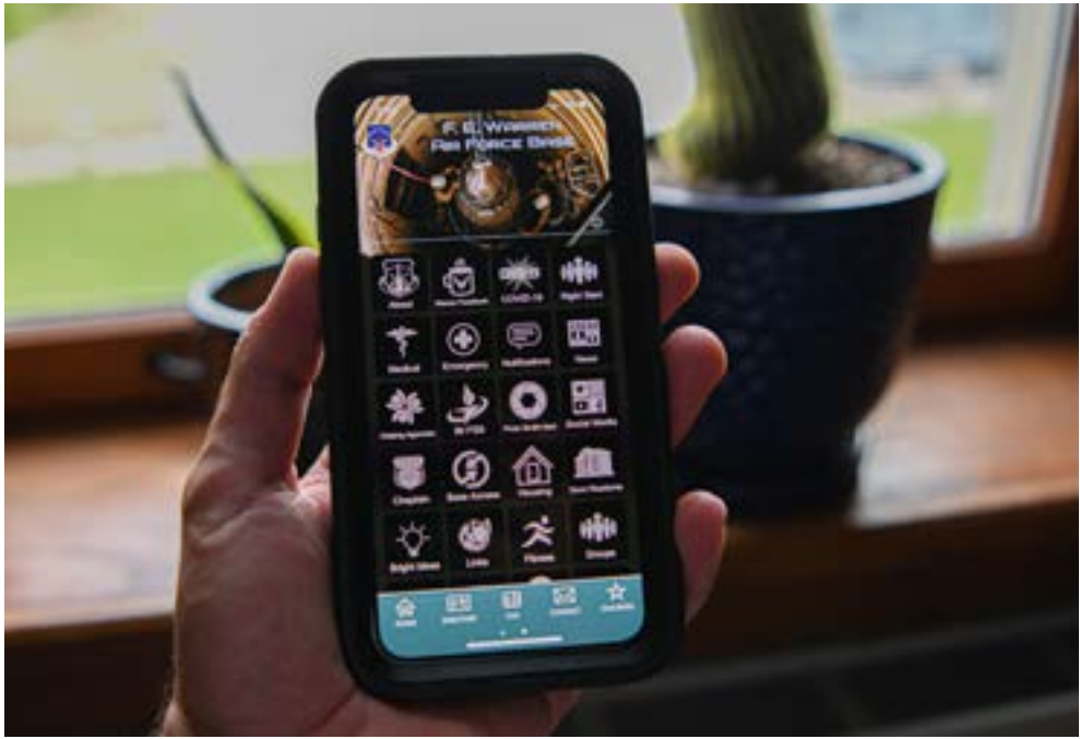
A phone displays the Air Force Connect app at F.E. Warren Air Force Base, Wyoming, July 30, 2021. The Air Force Connect app can now be used to assist Airmen out-processing from F.E. Warren Air Force Base.

The out-processing team is continuously seeking ways to make the out-processing system more efficient after applying it to all Airmen out-processing off base.