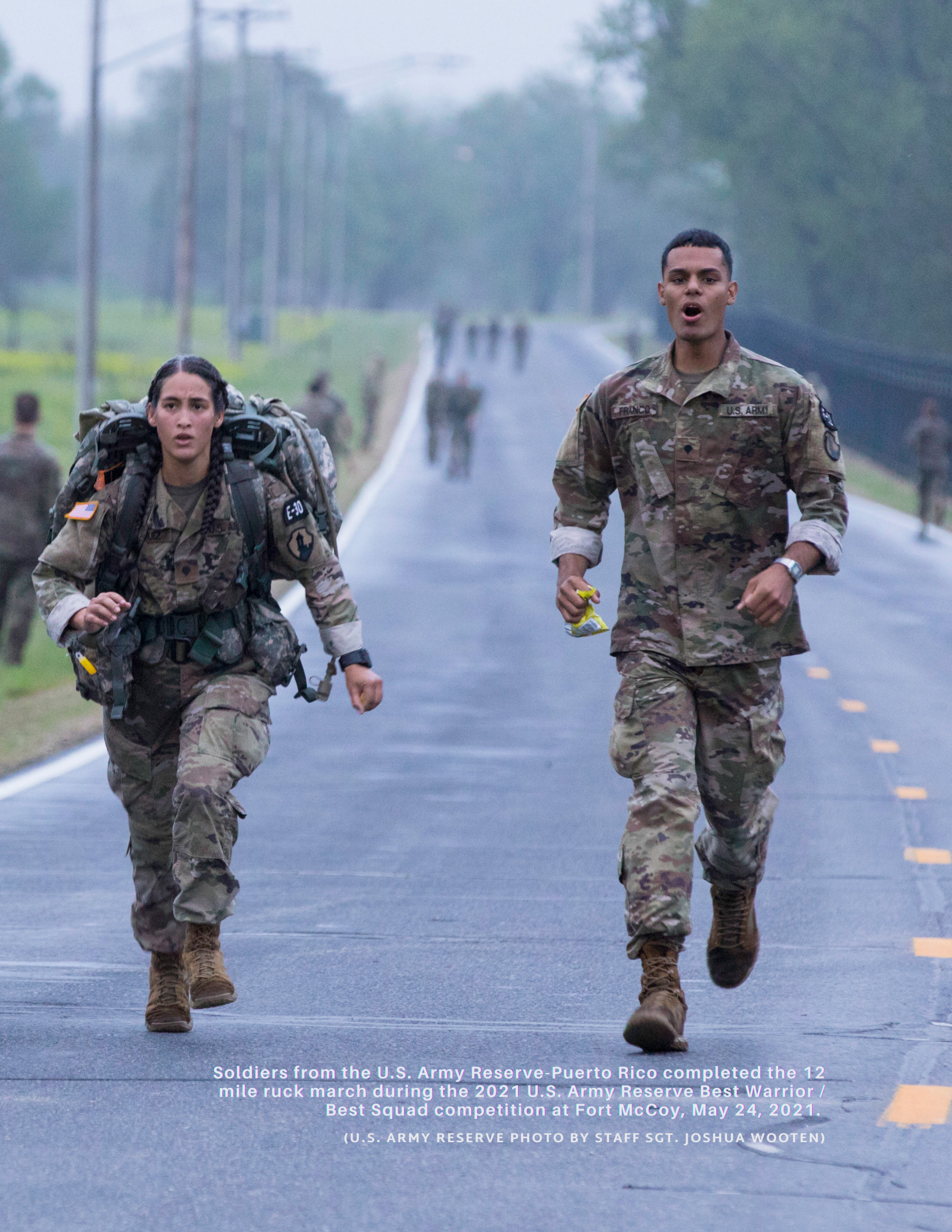
Soldiers from the U.S. Army Reserve-Puerto Rico completed the 12 mile ruck march during the 2021 U.S. Army Reserve Best Warrior / Best Squad competition at Fort McCoy, May 24, 2021.