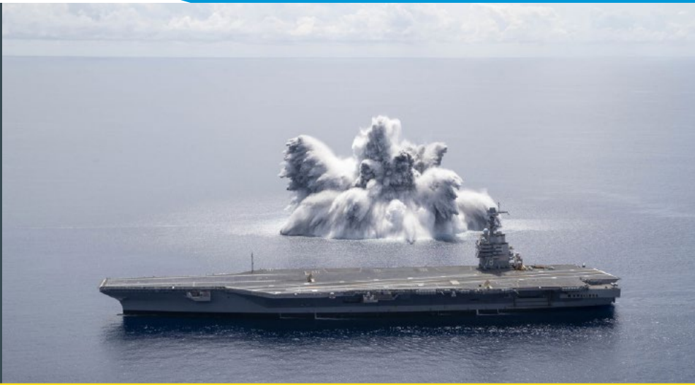
The aircraft carrier USS Gerald R. Ford (CVN 78) completes the first scheduled explosive event of full ship shock trials while underway in the Atlantic Ocean on June 18, 2021.