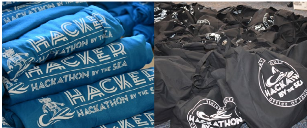
Hackathon by the Sea students receive swag bags filled with t-shirts and water bottles from NAVFAC EXWC and VCOE.

NAVFAC EXWC and the Ventura County Office of Education co-host a virtual hackathon event for students grades 9-12