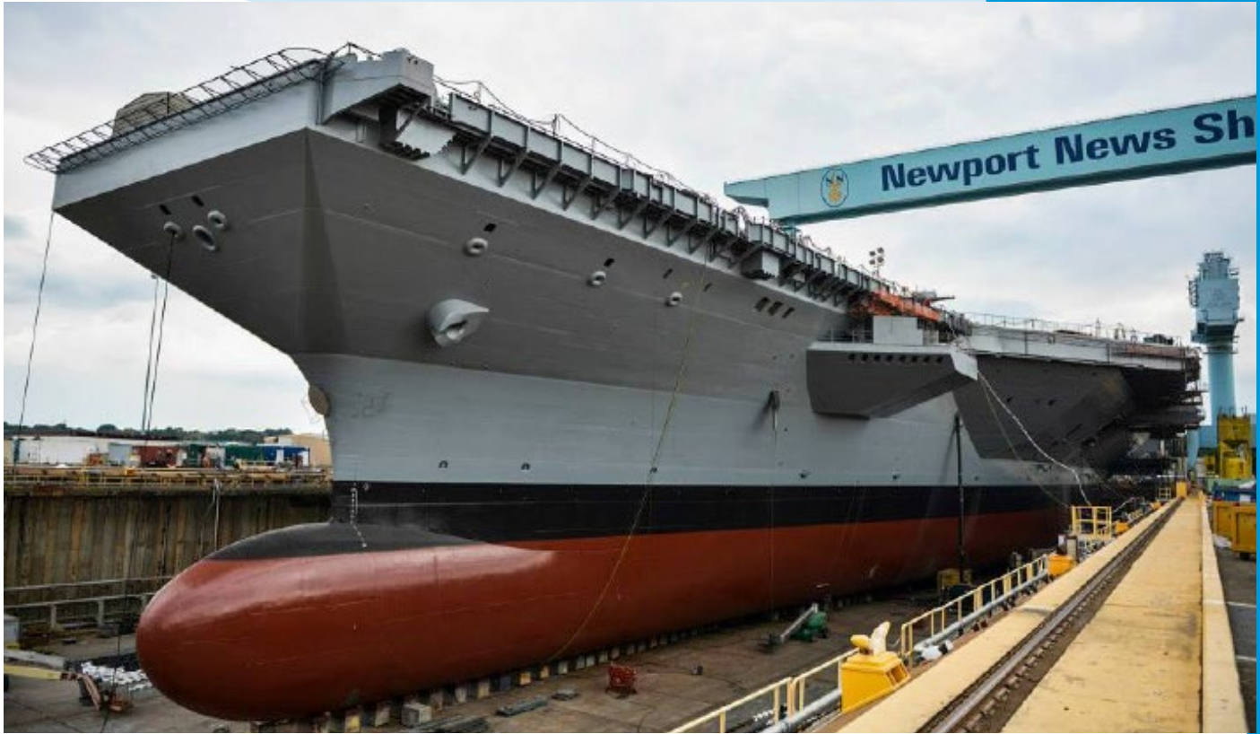
USS Gerald R. Ford (CVN 78) under construction at Newport News Shipyard in Newport News, Va.

Ford is part of the new Ford Class carriers that need accessibility to different voltage requirements when homeported. The infrastructure of some piers is wired for Nimitz-Class aircraft carriers, does not offer the voltage support required for Ford Class carriers. In the interim, a MUSE substation provides shore power and associated transformer technology to convert a shore facility with a high voltage supply to the medium voltage requirements of the Ford class ships.