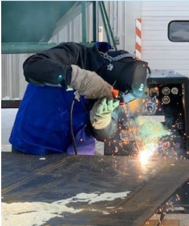
Unidentified Sailor tests welding equipment capabilities during ICEX 2021 at Thule Air Base in Greenland.

McVicar added in the intervening years, the Navy has updated thousands of pieces of equipment within the table of allowance without a full evaluation of the equipment in both arctic and polar conditions.