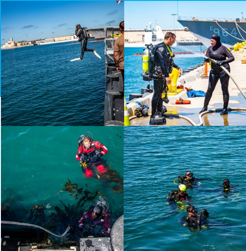
Assortment of diving photos taken at CT21, June 20-24, 2021 in Port Hueneme, Calif.

During the exercise, participants used an Echoscope Sonar System (real-time three-dimensional sonar) and