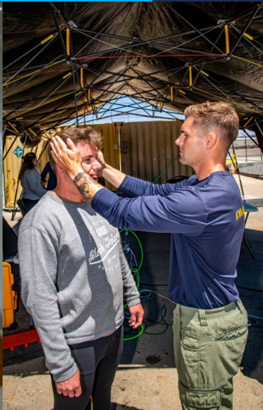
Assortment of diving photos taken at CT21, June 20-24, 2021 in Port Hueneme, Calif.

the event had limited diving experience, of which, focused on training to perform enclosed space diving and other types of less egregious missions.