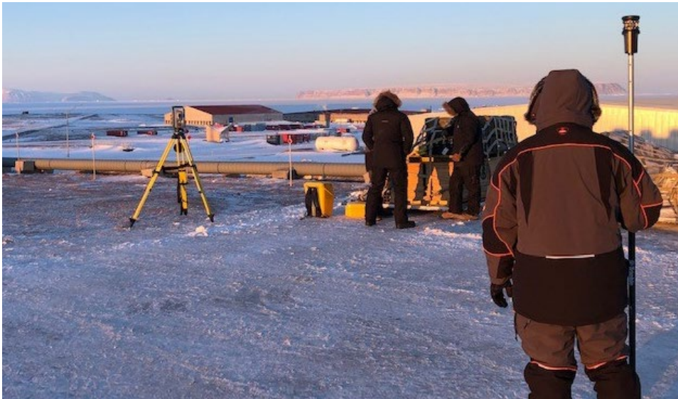
Teams attending ICEX 2021 survey equipment to ensure their capabilities are not impacted by harsh arctic conditions at Thule Air Base in Greenland.