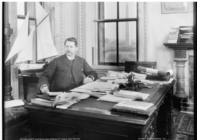
Capt. Norman Von Heidreich H. Farquhar, Chief of the Bureau of Yards and Docks, 1894 to 1897.