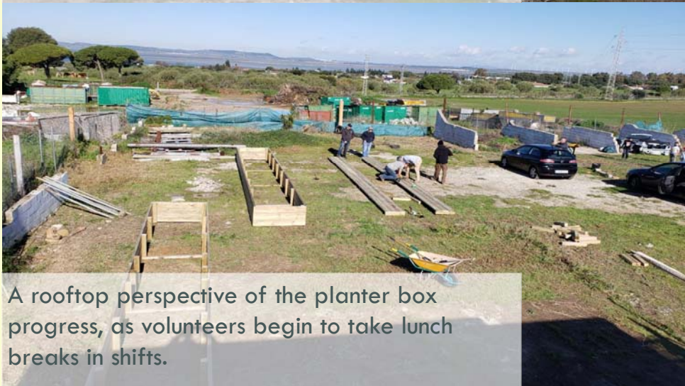
A rooftop perspective of the planter box progress, as volunteers begin to take lunch breaks in shifts.