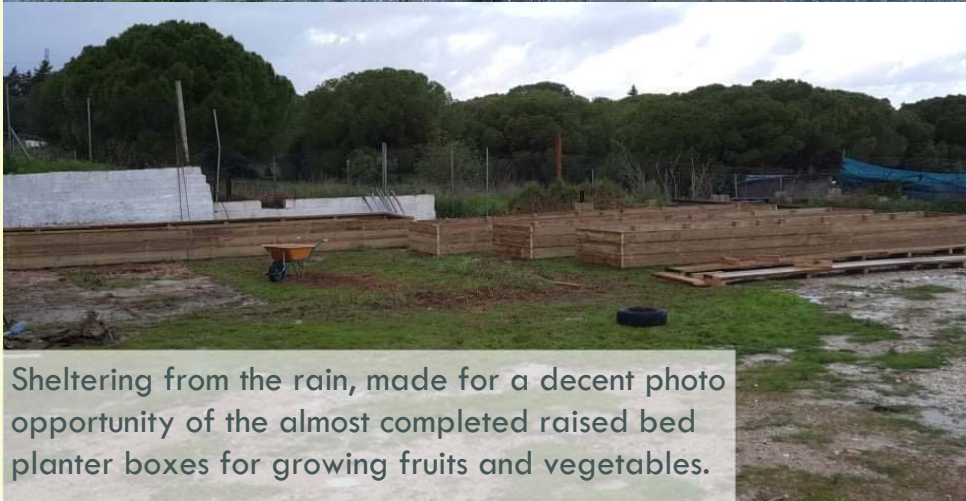
Sheltering from the rain, made for a decent photo opportunity of the almost completed raised bed planter boxes for growing fruits and vegetables.