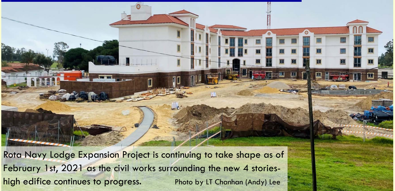
Rota Navy Lodge Expansion Project is continuing to take shape as of February 1st, 2021 as the civil works surrounding the new 4 stories-high edifice continues to progress.