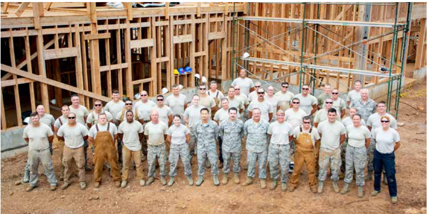
Airmen with the 139th Civil Engineers pose for a group photo at their construction site at Camp Paumalu, Halewehi, Hawaii.

The 139th Civil Engineer Squadron had a great year. As FY2020 starts, we are continuing on a strong path in preparation for the next round of deployments in fiscal year 2022.