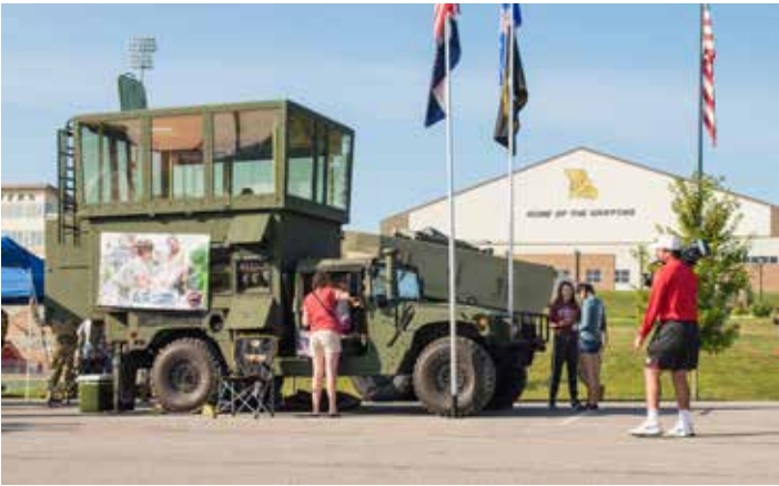
The 241st ATCS displays its mobile air traffic control tower, during military appreciation day at the Kansas City Chiefs Training Camp.

The 241st faced and overcame numerous challenges. These included safeguarding Missouri and Kansas citizens from natural disasters, enabling the operational testing and evaluation (OT&E) of a new deployable air traffic control approach landing systems (DATCALS) and supporting various program offices in the modernization efforts of the Deployable Air Traffic Control Approach Landing Systems fleet. Additionally, the 241st has a member deployed to Africa in support of Operation FREEDOM SENTINAL. His mission is sustaining the air traffic control command and control function supporting the Combatant Commander's counter terrorism, intelligence, surveillance and reconnaissance mission. As always, the determination of the men and women of this organization met each one of these tests, overcame and successfully carried out the myriad of missions placed before them.