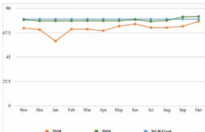
Wing Individual Medical Readiness Statistics