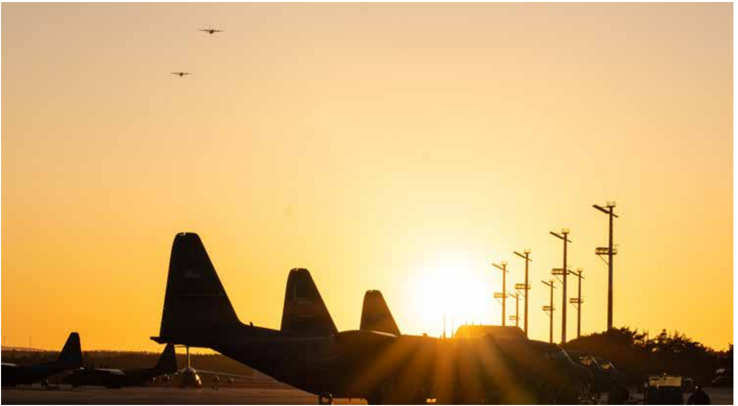
U.S. Air Force C-130 Hercules aircrafts, are parked along the flight line of Ramstein Air Base at sunset, during Saber Junction 19, Sep. 18, 2019. SJ19 is an exercise involving nearly 5,400 participants from 16 ally and partner nations at the U.S. Army's Grafenwoehr and Hohenfels Training Areas, Sept. 3 to 30 Sept. 2019. SJ19 is designed to assess the readiness of the U.S. Army's 173rd Infantry Airborne Brigade to execute land operations in a joint, combined environment and to promote interoperability with participating allies and partner nations.