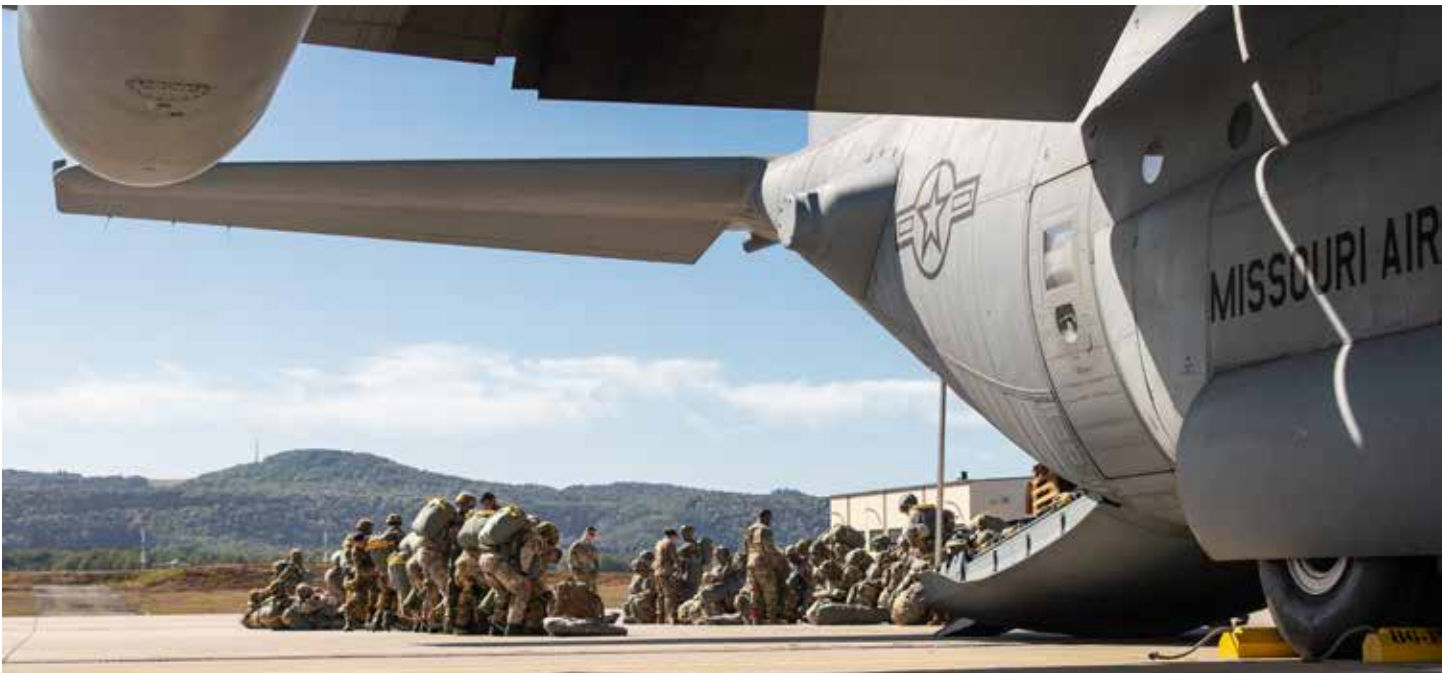
Army paratroopers with the 173rd Airborne Brigade along with Italian paratroopers prepare their gear prior to boarding a U.S. Air Force C-130H Hercules aircraft during Saber Junction 19, at Ramstein Air Base, Germany, Sep. 18, 2019.

The 139th Operations Group has maintained a war ready status in light of incredible and non-standard challenges. Our members have been actively involved in local, state, and national operations. In light of all of the challenges, the 139th Operations Group executed 776 sorties and over 1,698 flying hours in 2019. We executed real world airlift missions in Germany, Italy, Hawaii, and all over the CONUS.