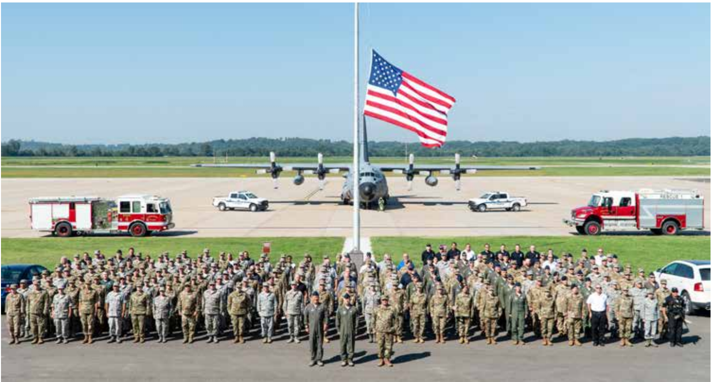
Airmen assigned to the 139th Airlift Wing, Missouri Air National Guard, stand at attention at Rosecrans Air National Guard Base, St. Joseph, Missouri, Sept. 11, 2019. The wing observed a moment of silence in recognition of the 18th anniversary of the 9/11 terrorist attacks.