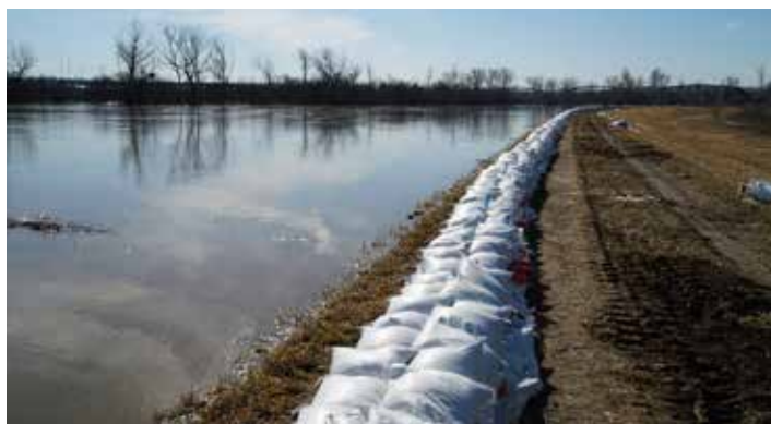
An increase in water levels of surrounding rivers and waterways caused by record-setting snowfall over the winter in addition to a large drop in air pressure caused flooding across the midwest.

Riley, Kansas, with a portion here at Rosecrans for duty specific training. While at Fort Riley, our defenders trained on and qualified with the MK19 automatic grenade launcher, M2 .50 caliber machine gun, and the M240 and M249 medium machine guns. These are typically long and hot days on the range, but due the strong work ethic of our defenders and the leadership of the combat arms shop, we maximized the airmen's time and achieved high quality weapons