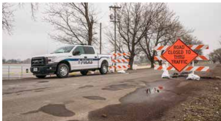
Airmen with the 139th Security Forces Squadron, secure an entry point to a levee near Lake Contrary in St. Joseph, Mo., March 20, 2019.