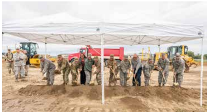
Airmen with the 139th Communications Flight, pose for a photo during a groundbreaking ceremony for the new Communications Complex at Rosecrans Air National Guard Base, Oct. 9, 2019.

Now, as the days become shorter and the fourth quarter is upon us, the many accomplishments of the 139th CF, all while supporting numerous projects, building moves, and mission growth, is truly awe inspiring. Mother Nature couldn't rain on your parade.