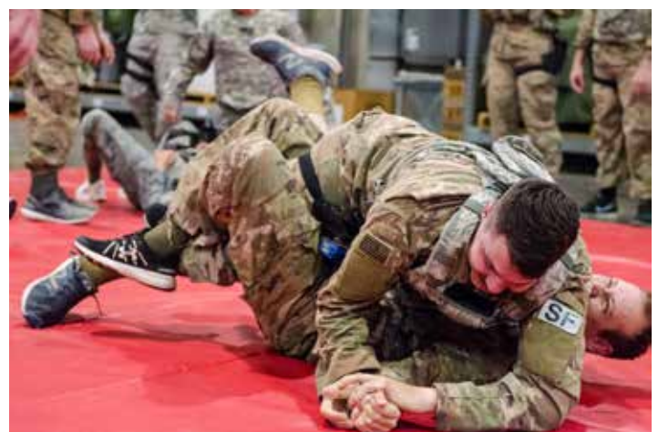
U.S. Airmen assigned to the 139th Security Forces Squadron, Missouri Air National Guard, participate in Combat Level 1 training at Rosecrans Air National Guard Base, in St. Joseph, Mo., Jan 6, 2019. The training involved weapons retention techniques, basic military defensive techniques, as well as non-lethal weapon training.