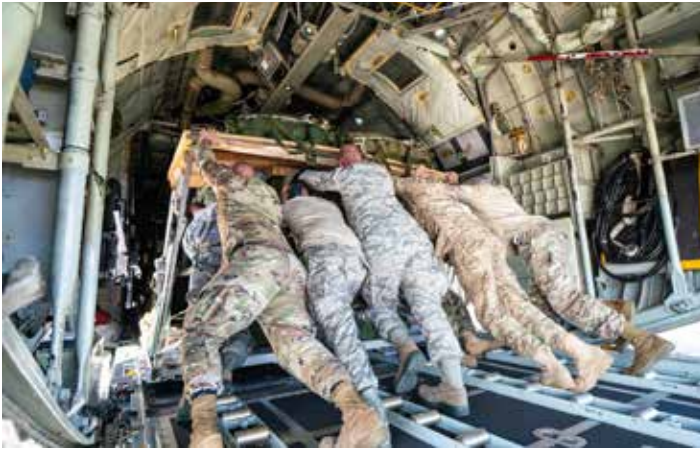
Airmen with Air Terminal Operations, 139th LRS, load a heavy equipment platform onto a C-130 Hercules assigned to the 302nd Airlift Wing, AFRC, prior to the execution of an airdrop during Saber Junction 19 at Ramstein Air Base, Germany, Sept. 19, 2019.

Air Terminal Operations: ATO supported missions on 3 separate continents, in direct support and coordination for 10 countries providing world-class aerial port support. During FY19, ATO supported ten Advanced Tactics Aircrew Courses, at two geographically separated locations for the AATTC.