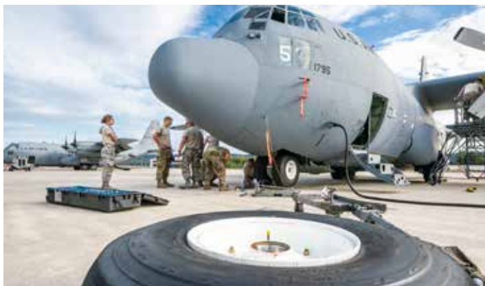
Airmen with the 139th MXG, change the front tires of a C-130H Hercules aircraft during Saber Junction 19, at Ramstein Air Base, Germany, Sep. 22, 2019.

Finally, when most wings were slowing down for the end of the year, the 139th MXG was taking the lead on airlift support for Saber Junction 2019. 139th personnel from the Wing, Missouri National Guard, Kentucky ANG, Ohio ANG, and the USAF Reserve's 302nd AW from Colorado airdropped nearly 539 paratroopers and a combined total of 617,000 pounds dropped in the Hohenburg, Germany drop zone. The exercise is a large-scale, multinational combat certification to assess the readiness of the U.S. Army's 173rd Airborne Brigade to execute land operations in a joint, combined environment.