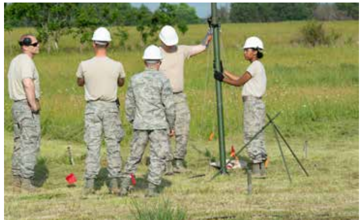
Members of the 241st ATCS participate in the Vigilant Guard 2019 exercise June 3-6, 2019.

The full-time force successfully went through Air Combat Command's (ACC) Unit Evaluation Inspection program. ACC inspectors found zero write-ups and commended the full-time team that enhanced the safety of military and general aviation safety for 24,903 aircraft operations. The USAF merged Radar Maintenance and Airfield Systems career fields into the Radar Airfield Weather Systems. The maintenance personnel have taken the challenge of cross training personnel to meet HAF requirements while simultaneously supporting multiple program offices in the modernization of the Mobile Tower and TACAN UTCs.