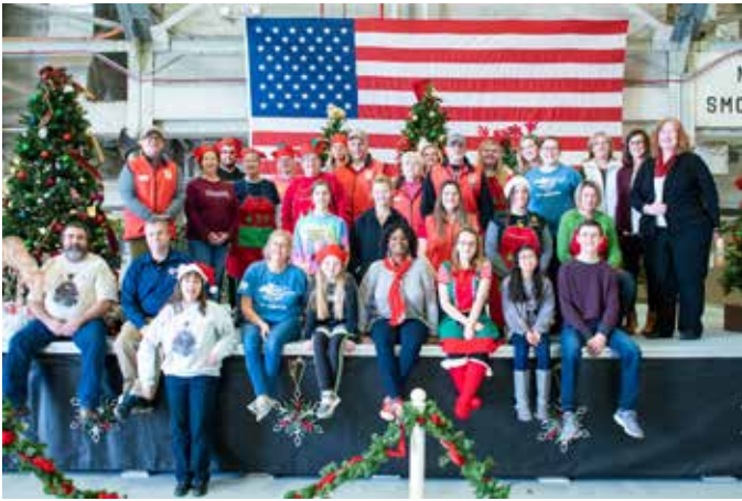
Volunteers for the annual Children's Christmas Workshop pose for a group photos at Rosecrans Air National Guard Base, Dec. 8, 2019.

~ Gen. David Goldfein, Chief Staff of the Air Force