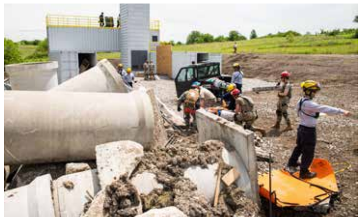
Airmen and Soldiers with the Missouri Air and Army National Guard, along with civilian counterparts, take part in the disaster response exercise Vigilant Guard, at Mazingo Outdoor Education and Recreation Area, in Maryville, Mo., June 4, 2019.

Recurring maintenance plan and grounds upkeep continued to keep the Operations Maintenance Section busy all year. Operations also stays busy planning