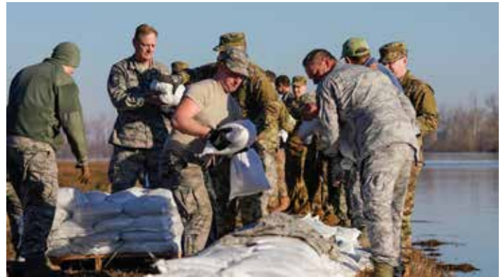
U.S. Airmen assigned to the 139th Airlift Wing, Missouri Air National Guard, lay sandbags along a levee in Elwood, Kansas, that protects Rosecrans Memorial Airport and surrounding communities, on March 22, 2019.

Materiel Management: MM inventoried 5,820 line items with 66,585 assets worth $18.9 million; 1,442 repair cycle turn-ins; verified and cleared 10,090 1348s; pulled 7,798 issues; processed 9,218 shipments as well as 142 condition code changes. MM also created, changed, or deleted 1,759 storage locations, inspected 2,687 warehouse assets, processed 178 MSIs issuing parts to aircraft, processed 24 functional checks, received 183 assets for put-away, and processed 298 shelf life turn-ins. Clothing Issue placed 547 KYLOC orders for 3,092 assets worth $253 thousand, while HAZMAT processed 224 receipts and 331 ISU/DORs, and recycled 35,500 pounds of scrap metal returning $1,610 to the Wing Environmental fund. Mobility completed a 100 percent inventory of 22,000 assets worth $1.2 million, built and broke down 550+ bags in support of 17 CBRNE training