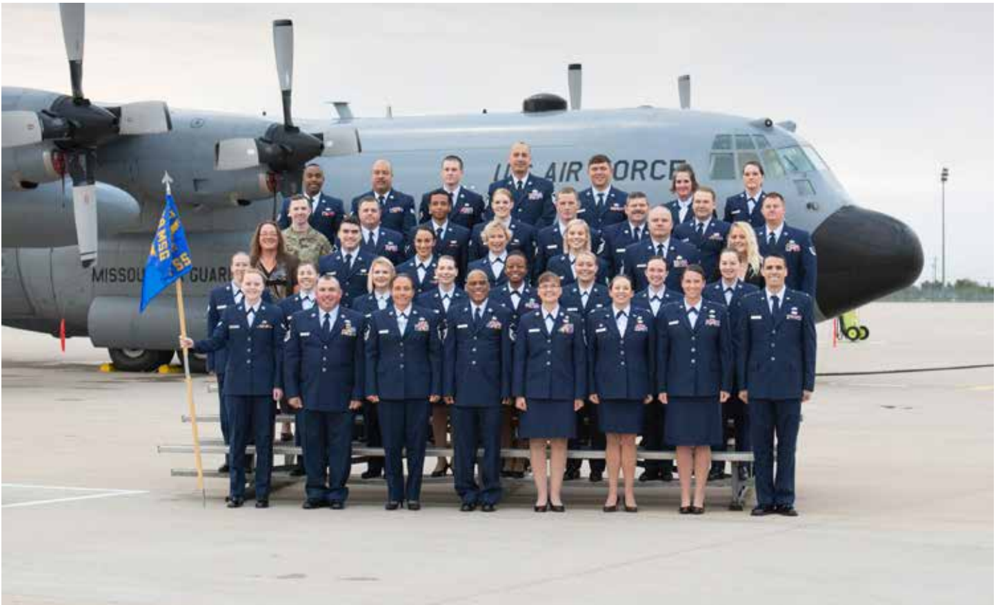
The 139th Force Support Squadron, Missouri Air National Guard, poses for a group photo at Rosecrans Air National Guard Base, St. Joseph, Missouri, Oct. 6, 2019.