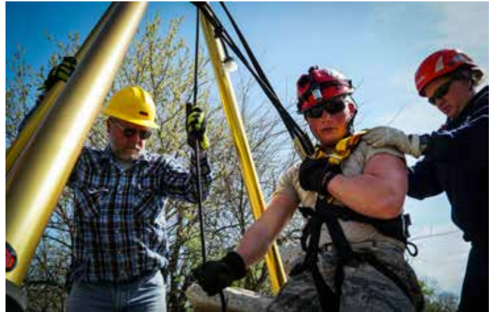
Det 1 Airmen participate in search and extraction training at the Mazingo Outdoor Education and Recreation Area, Maryville, Mo., on April 5, 2019.