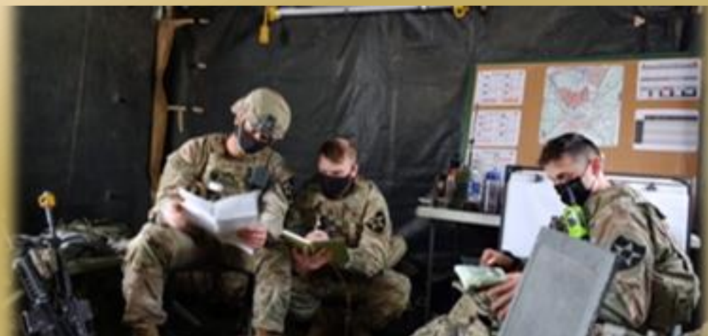
(Above) Leaders of Bronco Troop, 1-14 Cav. developing plans and orders, to provide direction to their platoons during recent training exercises at JBLM. (Right) Crazyhorse Troop’s Mortars Section competing in Squad competition.