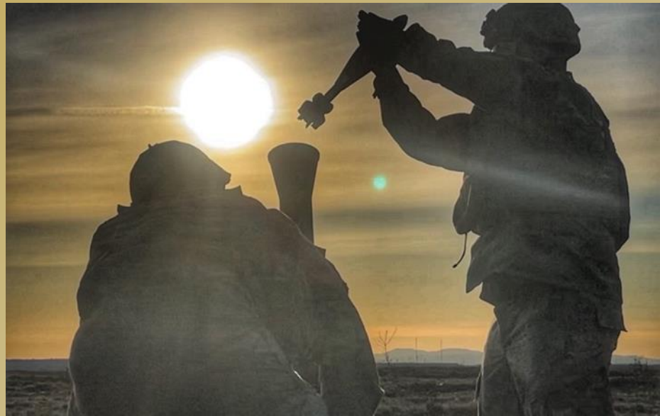
(Left) Soldiers train on the Mk-19 as part of Gunnery Skills Testing. (Above) Soldiers conduct mortar gunnery, culminating in combined use of illumination and high-explosive rounds for devastating effects.