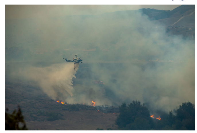
A San Diego Sheriff Bell 205 A1 fire and rescue helicopter drops water in an effort to extinguish the Creek Fire aboard Marine Corps Base Camp Pendleton, California, Dec. 24, 2020. Camp Pendleton Fire Department and Cal Fire San Diego are in a unified command to battle the 3,000 acre fire.