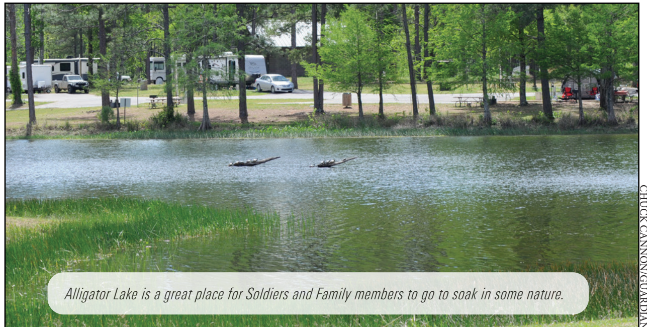
Alligator Lake is a great place for Soldiers and Family members to go to soak in some nature.