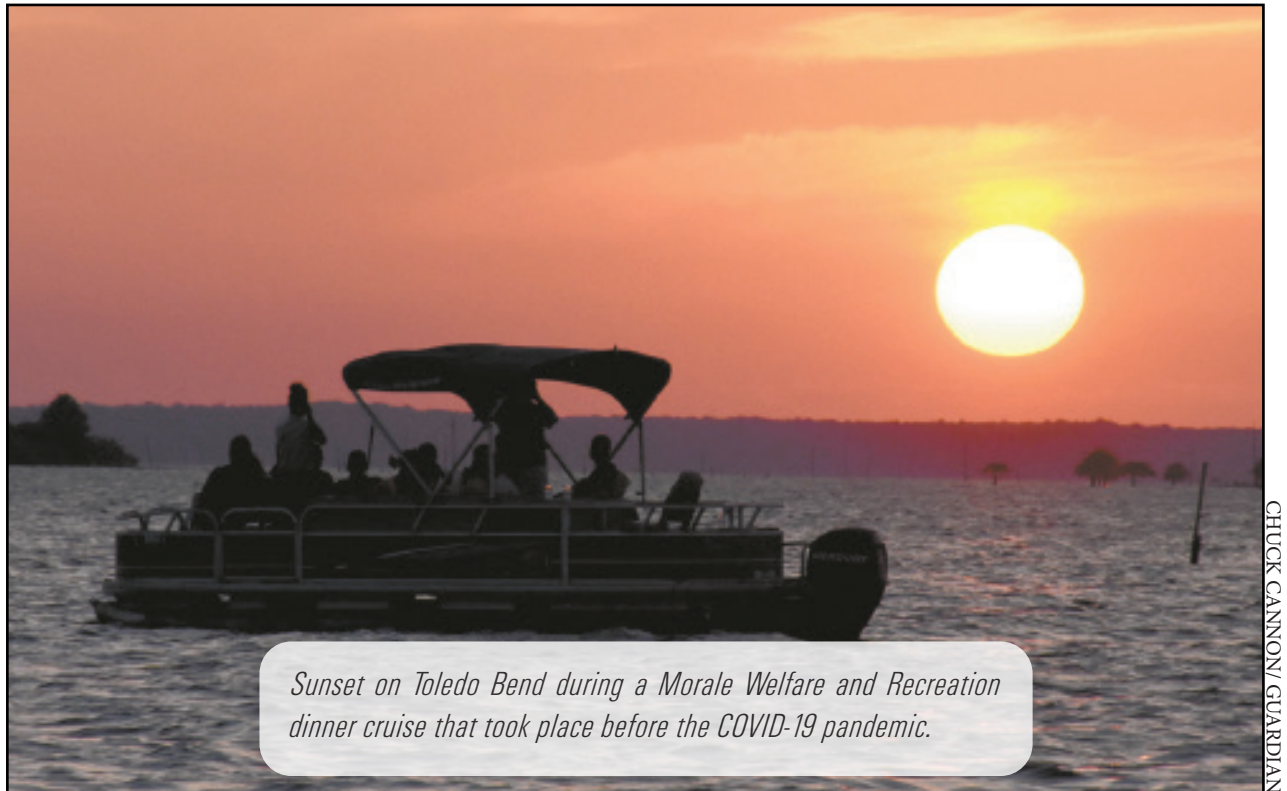
Sunset on Toledo Bend during a Morale Welfare and Recreation dinner cruise that took place before the COVID-19 pandemic.

The site's hours of operation are Thursday through Monday from 8 a.m.-4 p.m. The site is closed Tuesday and Wednesday.