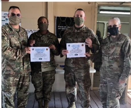
Deployed SARC's Working Together