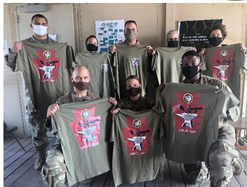
TF Anvil SHARP Team Celebrates Together