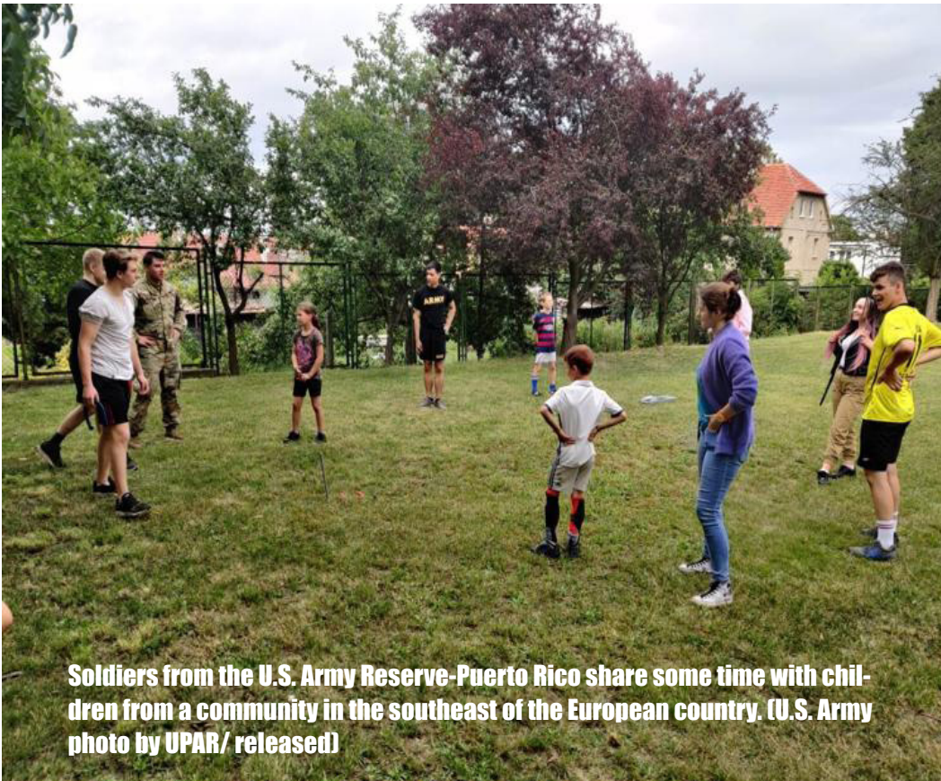
Soldiers from the U.S. Army Reserve-Puerto Rico share some time with children from a community in the southeast of the European country.

“The children really enjoyed our visit and I think we brought them a bit of joy. They also asked us a lot about Puerto Rico. That gave us the opportunity to share our culture. Some even tried to speak Spanish. That makes me feel good.”