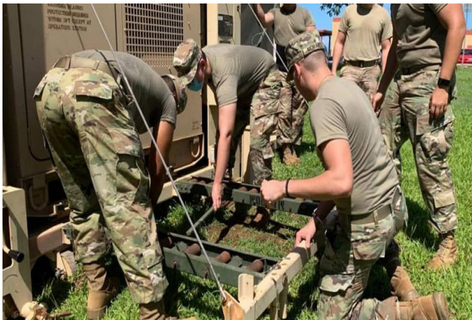
SOLDIERS FROM THE 1ST MISSION SUPPORT COMMAND PREPARING EQUIPMENT DUE TO THE TROPICAL STORM LAURA EMERGENCY, AUG.21.

By: U.S. Army 363rd Public Affairs Detachment