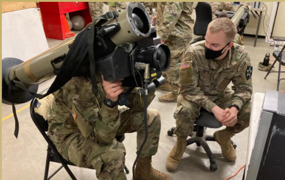
(Left) 1st Platoon, Rock Company conducts field training at JBLM. (Above) Soldiers conduct Javelin training on a computer simulator.