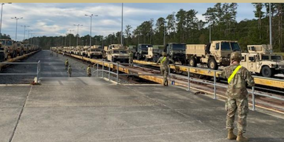
(Above) Soldiers and leaders from 1-23 IN supervise rail-yard operations at JBLM in preparation for JRTC.