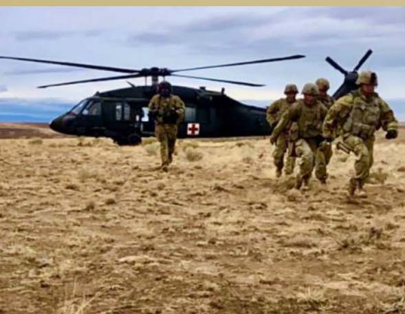
Patriot Soldiers conduct MEDEVAC training (above) and fire the AT-4 (right) during training at Yakima Training Center.