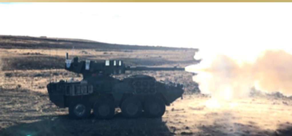
(Above) 1-14 CAV’s SSG Henry and crew zero their main gun ammunition on their Mobile Gun System prior to shooting gunnery at YTC. (Right) Sniper teams from 1-14 CAV train at Yakima Training Center.