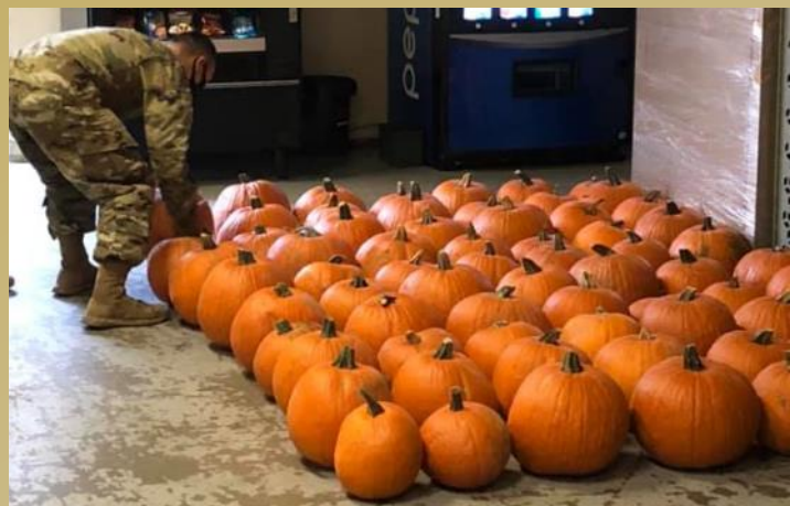
(Left) Soldiers conduct nasal pharyngeal airway training during C/296th's Combat Lifesaver Course. (Above) Avenger Company gathers pumpkins and candy to provide to their Soldiers and Families.