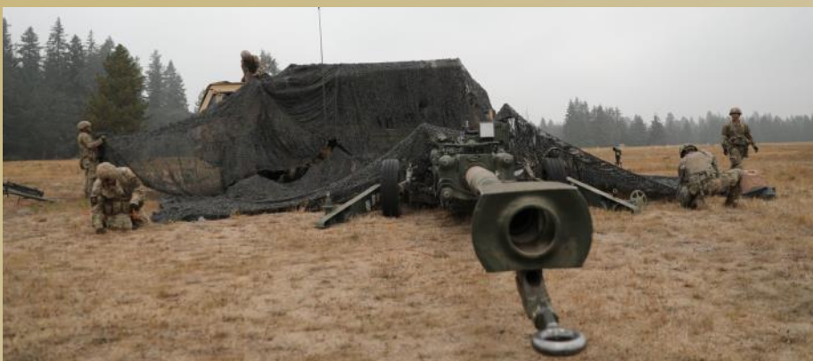
1-37 FA artillerymen FA Tables 13 and 14 in September, running through "dry fire" battle drills on their 155mm Howitzers, proving their ability to drop steel rain on enemy targets.