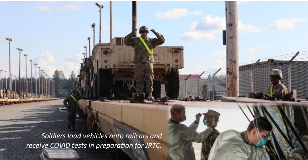
Soldiers load vehicles onto railcars and receive COVID tests in preparation for JRTC.