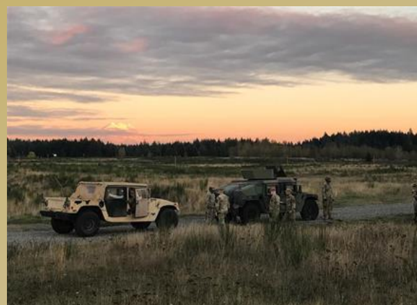
(Above) Soldiers await sunset as they prepare for refresher NVG training. (Left) A Soldier from UAS platoon and a Textron contractor observe the takeoff of the Aerosonde HQ aerial drone.