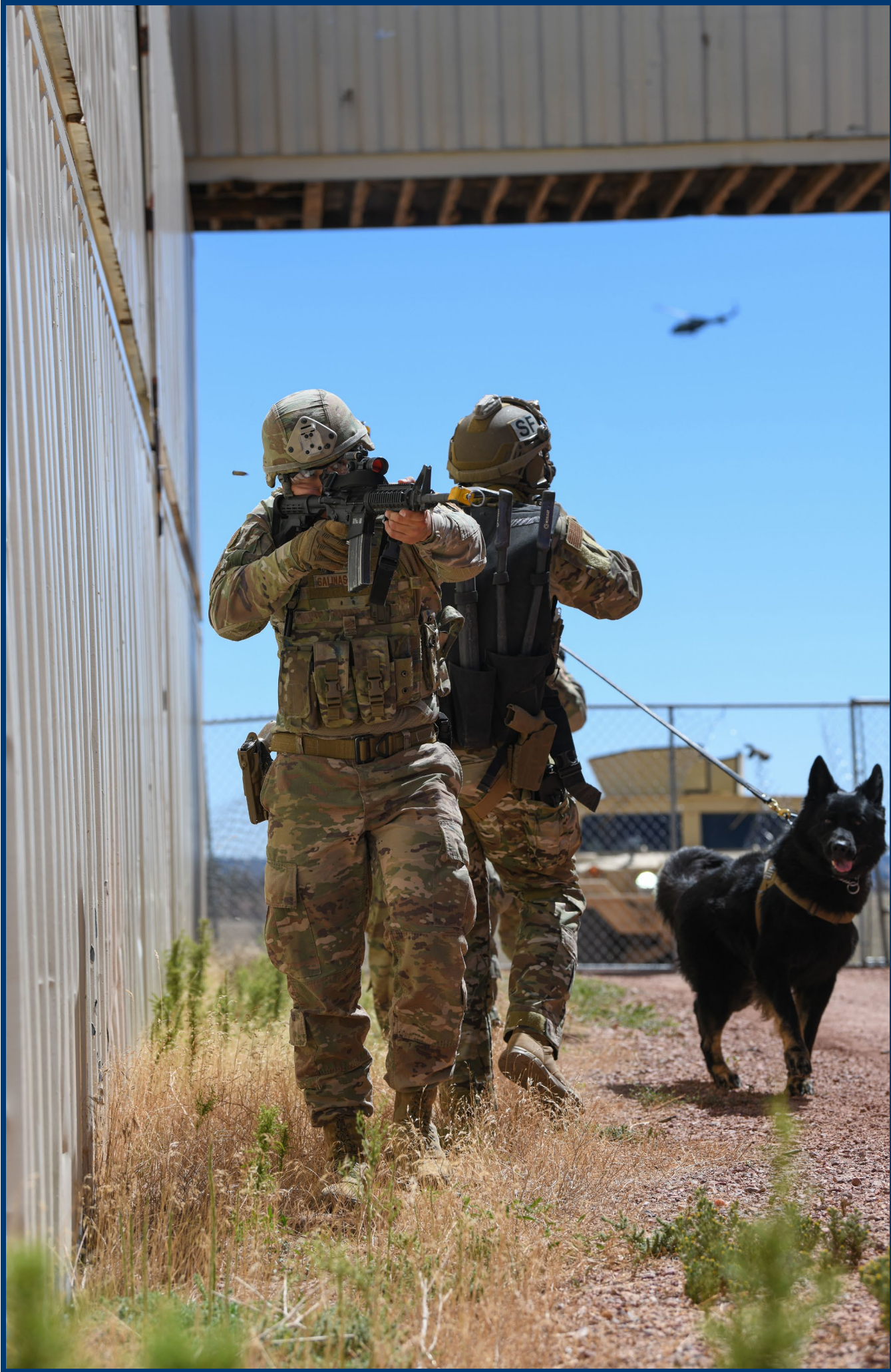
Defenders advance into simulated enemy territory during a hostage rescue exercise at Camp Guernsey, Wyo., Sept. 1, 2020. The exercise wrapped up a seven week Weapons and Tactics Instructor Course that involved defenders from every major command. The course covered standard law and order procedures that every defender is faced with throughout their career, as well as skill-sets that were more unique to specific missions across the Air Force such as nuclear security operations.