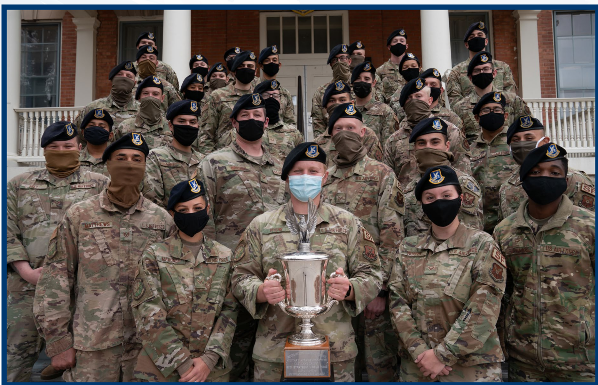
Airmen of the 790th Missile Security Forces Squadron pose for photos with the Cheyenne Trophy on F.E. Warren Air Force Base, Wyoming, Sept. 10, 2020. The Greater Cheyenne Chamber of Commerce recently presented the Military Affairs Committee's Cheyenne Trophy to the 790 MSFS for mission accomplishments, patriotism, off-duty volunteerism and community involvement resulting in a positive impact on the city of Cheyenne and its residents.