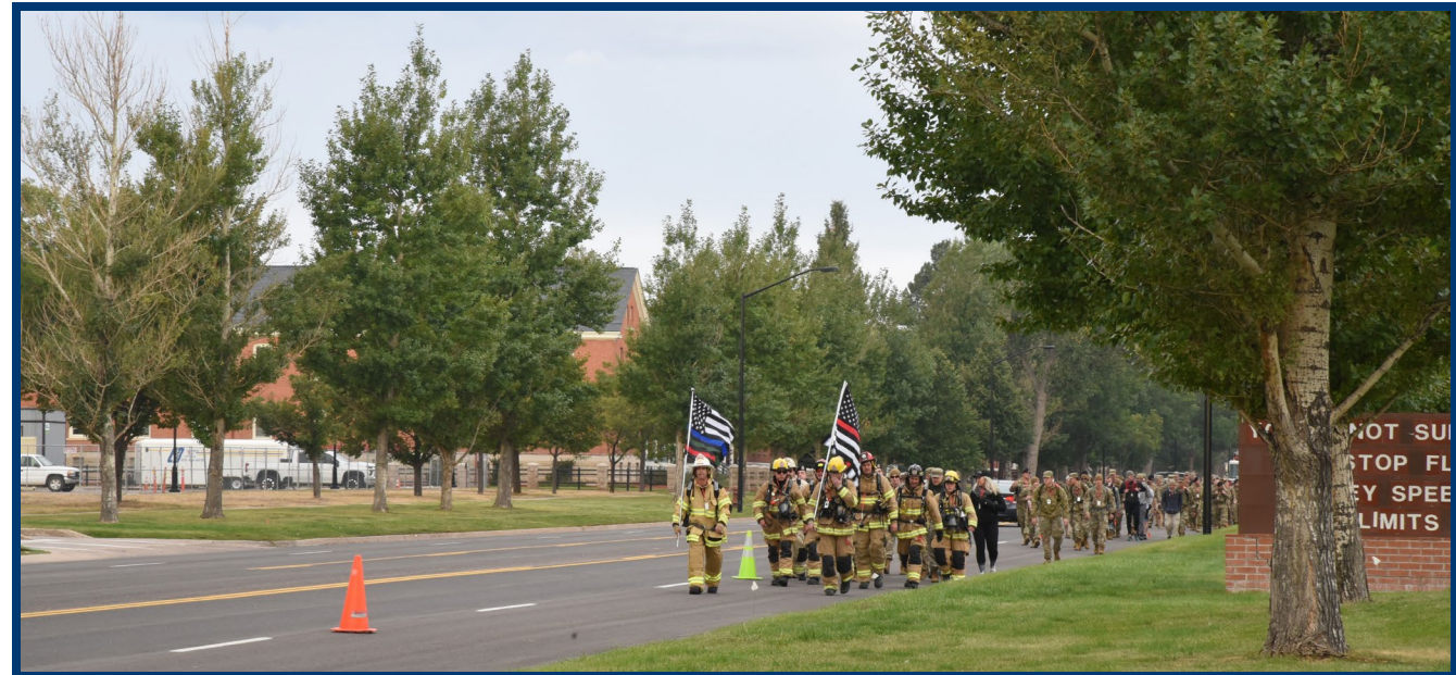
Servicemembers march down Randall Ave. during a 9/11 Remembrance Ceremony, Sept. 11, 2020 on F. E. Warren Air Force Base, Wyo. The event included a ceremony, followed by a ruck march. More than fifty individuals participated in the event honoring those lost in the terror attacks of Sept. 11, 2001.