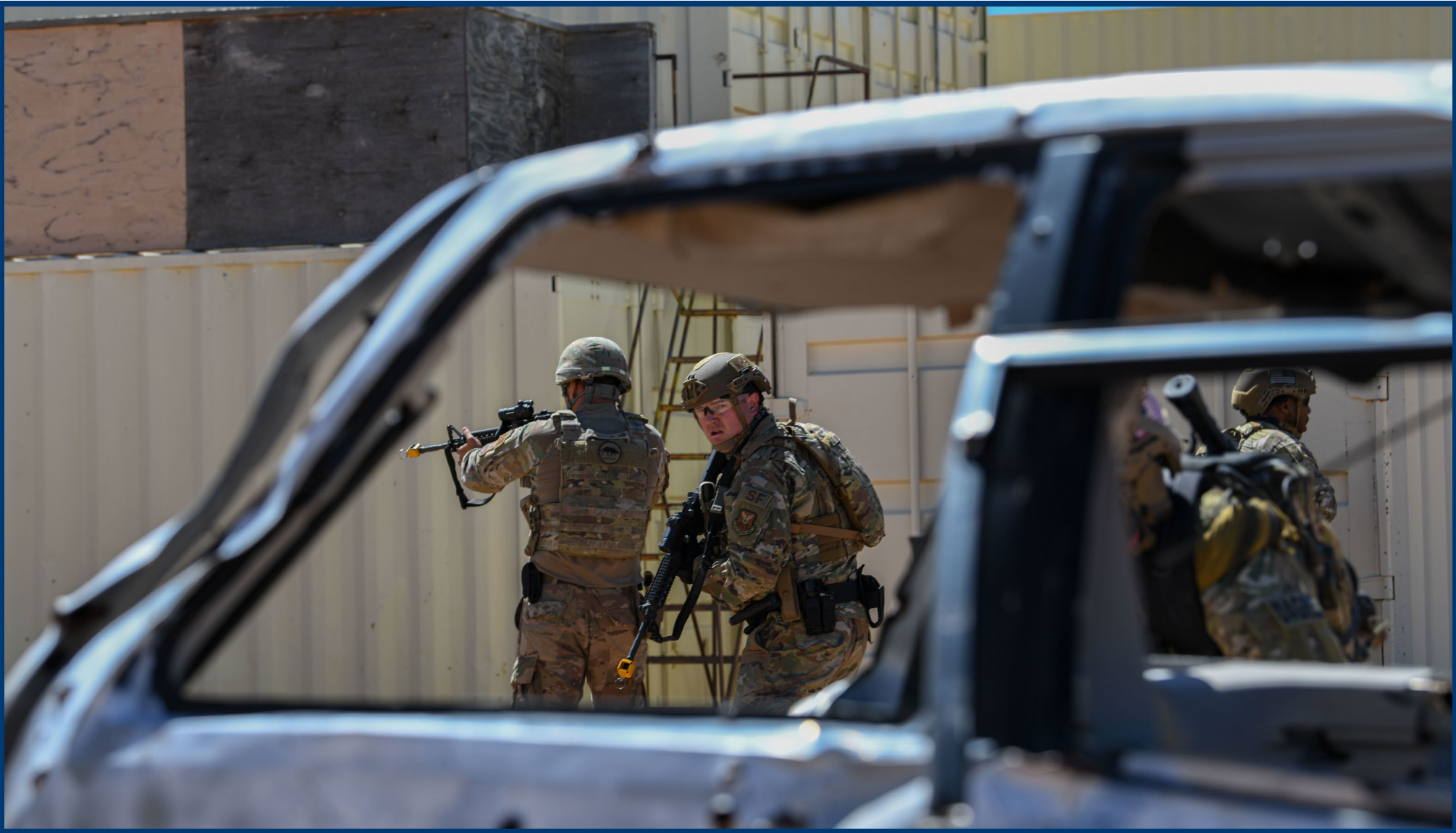
Students in the Weapons and Tactics Instructor Course use the knowledge they learned in the seven week training to advance through simulated enemy territory during a hostage rescue exercise in Camp Guernsey, Wyo., Sept. 1, 2020. Throughout the course, defenders learned skills such as reacting to situations while under stress and appropriately operating their weapons systems while fatigued.