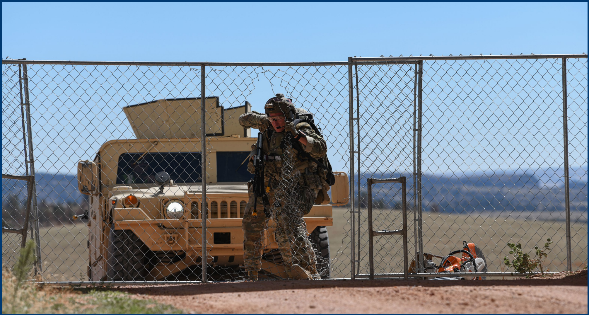
Students of the Weapons and Tactics Instructor Course access simulated enemy territory during a hostage rescue exercise at Camp Guernsey, Wyo., Sept. 1, 2020. The Weapons and Tactics Instructor Course brought defenders from every major command together in an effort to learn and utilize skillsets from more than just one mission area.

“It’s all about the person to your right and left,” he stated. “We are trying to create a team of teams, so when students leave, they understand that we all have a shared purpose.”