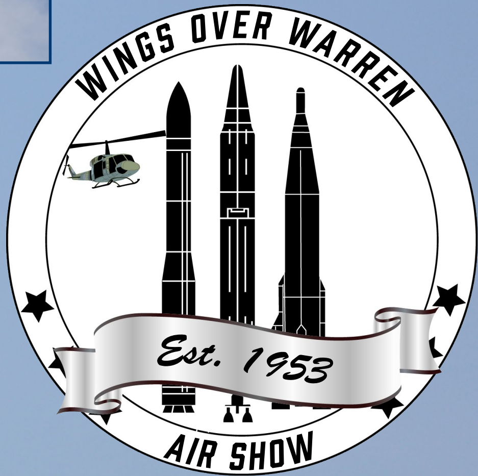
F. E. WARREN AIR FORCE BASE : JULY 22 2020