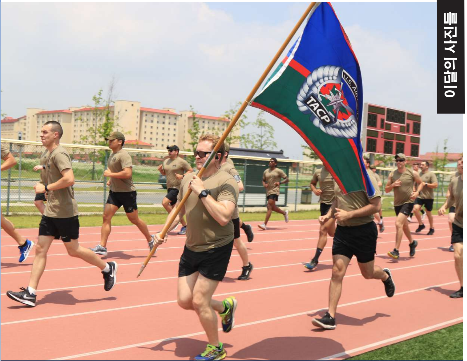
6월11일에서 6월 12일까지, 604 항공 지원 작전 대대는 전사자들을 추모하는 24시간 달리기 행사를 이행했다.