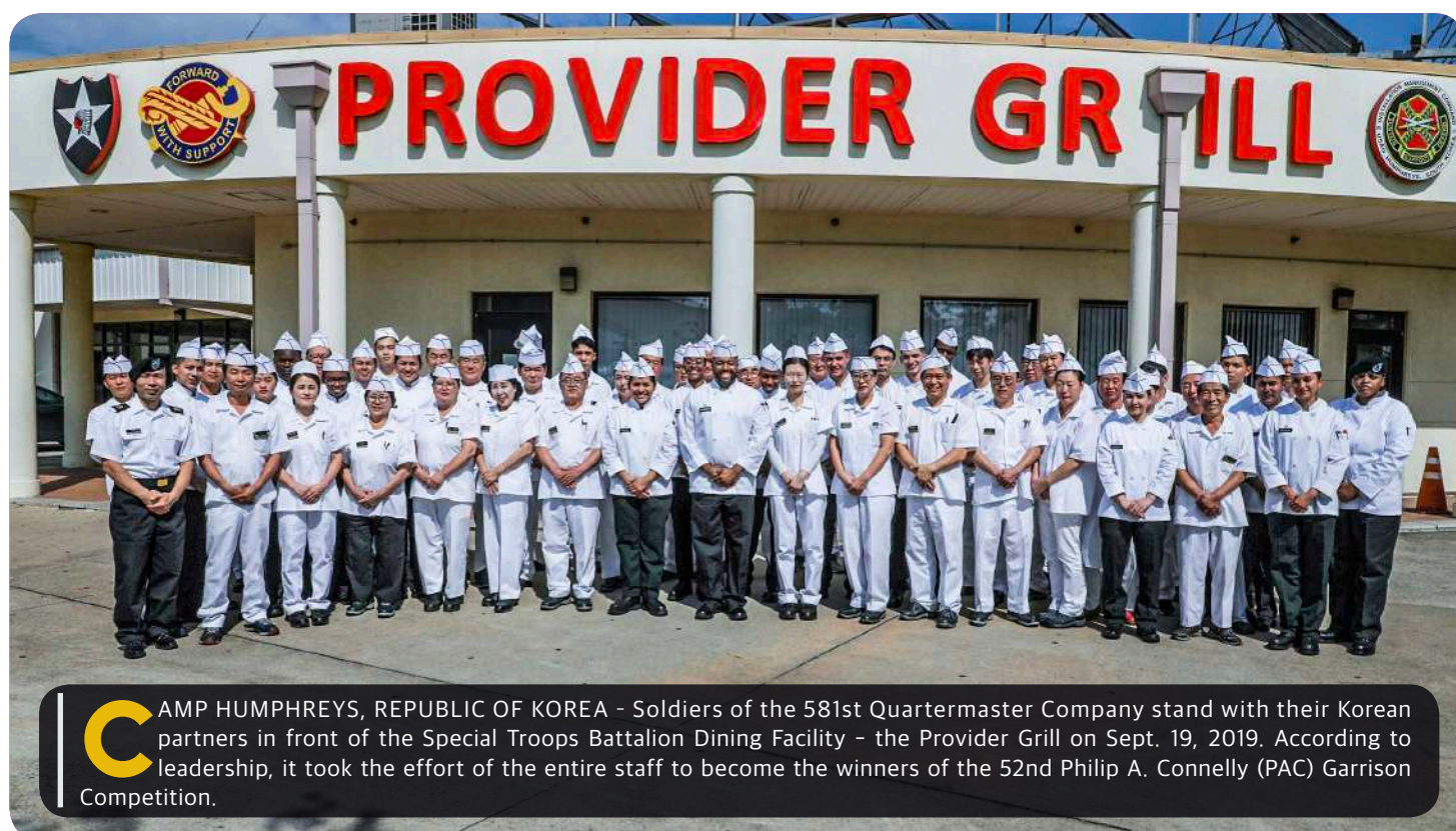
C AMP HUMPHREYS, REPUBLIC OF KOREA - Soldiers of the 581st Quartermaster Company stand with their Korean partners in front of the Special Troops Battalion Dining Facility - the Provider Grill on Sept. 19, 2019. According to leadership, it took the effort of the entire staff to become the winners of the 52nd Philip A. Connelly (PAC) Garrison Competition.