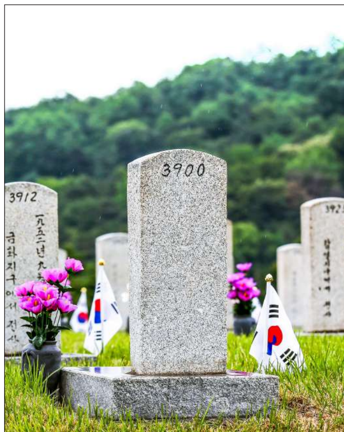
Cover Photo: Back