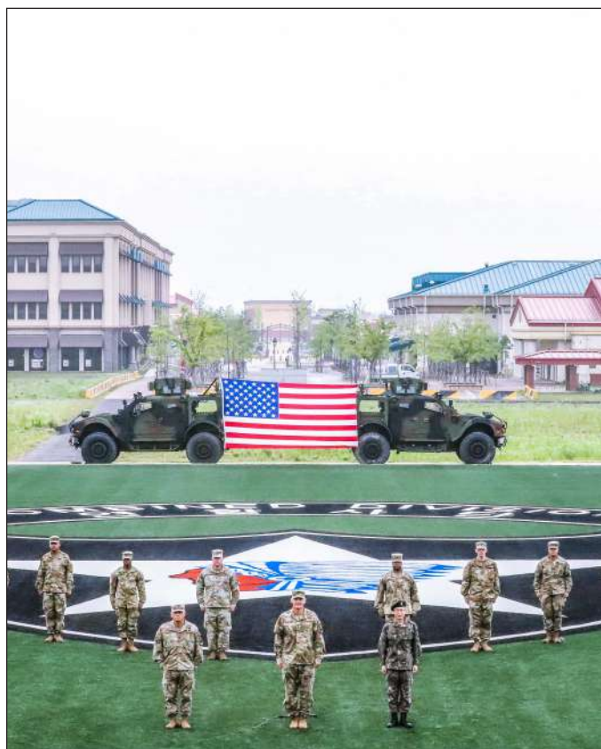
Cover Photo: Front

2ID/RUCD re-enlistment ceremony of 103 Soldiers at the Robertson parade field, June 3, 2020.