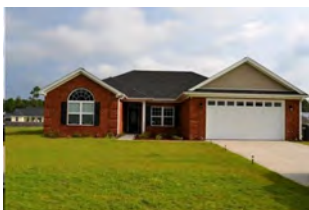
132 Bulloch Ct., Hinesville - $189,900

Quiet country living at its best! Outside city limits, no city taxes and less than 15 minutes to Fort Stewart gates and shopping! This mobile home sits on an acre, fresh new paint and carpet, features 4 bedrooms, 2.5 baths, formal dining room, eat in kitchen, central heating and air, room to stretch your legs, on a well and septic tank and roof is a few years old. Large open yard for gardening and children to play. Please contact Jimmy Shanken at 912-977-4733 cell or jimmy.shanken@theshankenteam.com