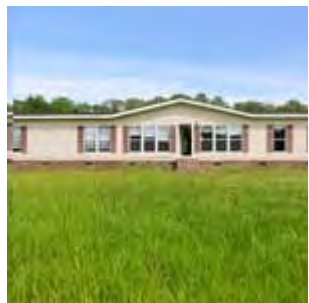
3111 John Wells Road, Hinesville - $99,900

Great opportunity to own a 3 bedroom 2 bath golf course home! This 2,182 SQFT home has a landscaped lot with a wraparound driveway. Property also features a fireplace, 2-car garage, and stainless steel appliances. This beautiful home is ready to be yours! Please contact Jimmy Shanken at 912-977-4733 cell or jimmy.shanken@theshankenteam.com