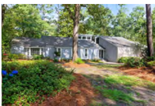
254 S Topi Trail, Hinesville - $169,900

Great opportunity to own a 3 bedroom 2 bath golf course home! This 2,182 SQFT home has a landscaped lot with a wraparound driveway. Property also features a fireplace, 2-car garage, and stainless steel appliances. This beautiful home is ready to be yours! Please contact Jimmy Shanken at 912-977-4733 cell or jimmy.shanken@theshankenteam.com