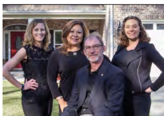
The Shanken Team REALTORS®