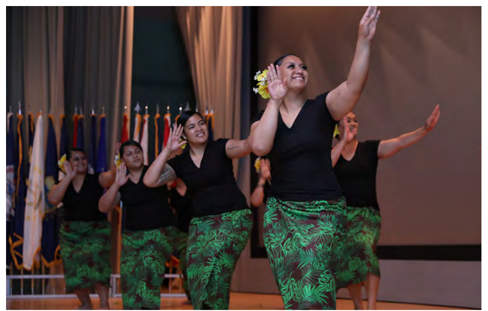
The 3rd Infantry Division island dancers, Toa O Samoa, perform a traditional dance May 20 during the Asian American Pacific Islander Heritage Observance ceremony at Woodruff Theater on Fort Stewart.