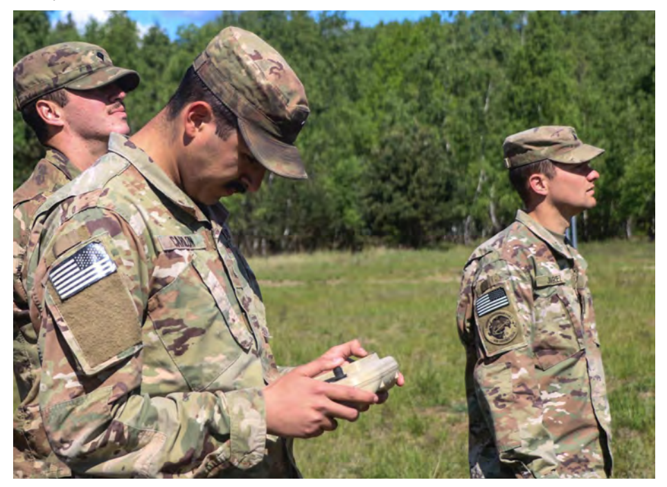
Spartan cavalry scouts with 6-8 CAV conducted a re-certification course for the AeroVironment RQ-11 Raven surveillance system May 18-22 at Glebokie, Drawsko Pomorski Training Area, Poland.

Spartan cavalry scouts with 6th Squadron, 8th Cavalry Regiment conducted a re-certification course for the AeroVironment RQ-11 Raven surveillance system May 18-22 at Glebokie, Drawsko Pomorski Training Area, Poland.