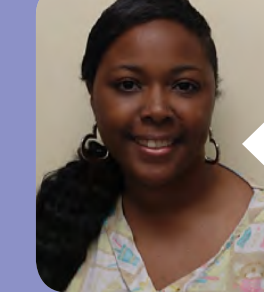
"Volunteer with the American Red Cross. There are always opportunities to volunteer."