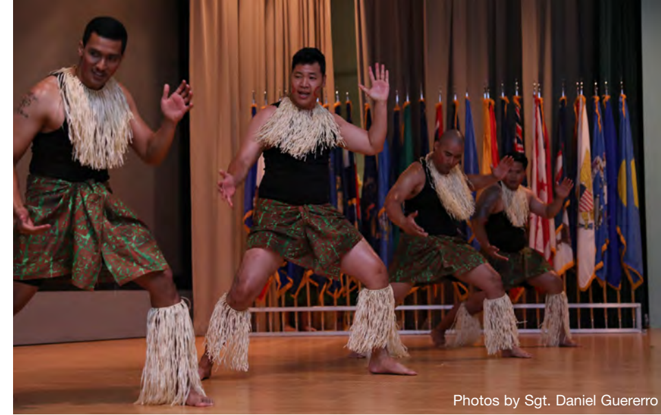
The 3rd Infantry Division Island Dancers perform a traditional dance May 20 during the Asian American Pacific Islander Heritage Observance ceremony at Woodruff Theater on Fort Stewart.