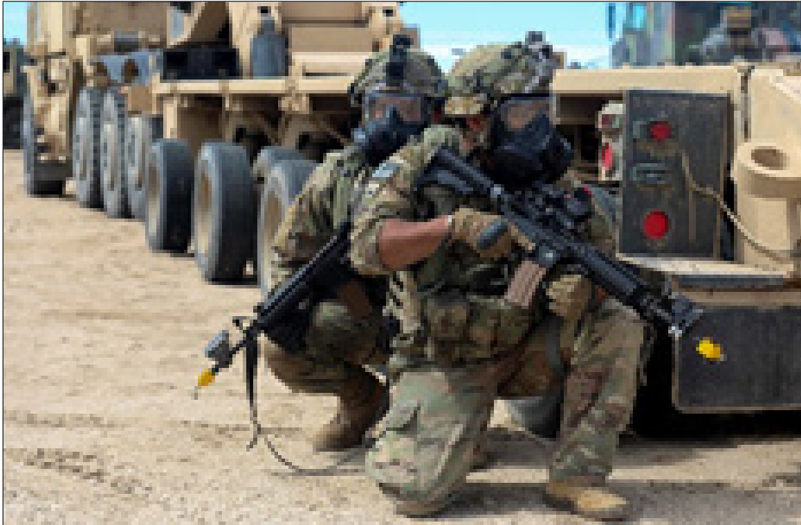
Left Soldiers assigned to the 1st Stryker Brigade Combat Team, 2nd Infantry Division, tactically maneuver during Decisive Action Rotation 20-05 at the National Training Center in Fort Irwin, Calif., March 16, 2020.

Here are the best photos from FORSCOM Public Affairs professionals world-wide. For more photos and information, click these photos or visit army.mil/forscom