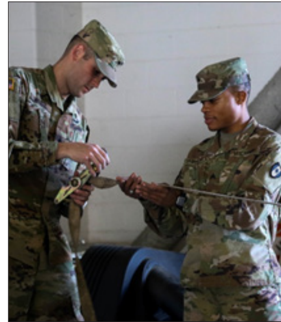
Right Soldiers assigned to the 531st Hospital Center and 586th Field Hospital, 44th Medical Brigade, prepare their gear for loading headed for New York in support of civil authorities and our nation's response to the COVID-19 pandemic, March 25, 2020.