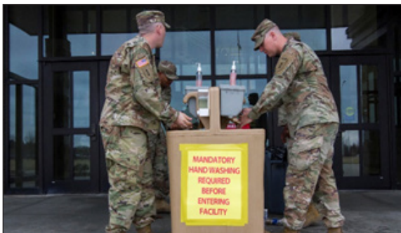
Above 1st Infantry Division Soldiers wash their hands at a designated hand washing station outside 1st Infantry Division Headquarters, Fort Riley, Kansas, March 18, 2020.