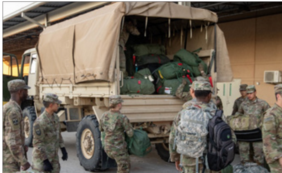
Soldiers with the 10th Field Hospital, 627th Hospital Center, 1st Medical Brigade, load their gear for a state-side deployment to Washington state, March 27, 2020.

WASHINGTON – As more people are exposed to COVID-19, the U.S. Army is preparing to provide medical support and hospital capacity to help states and other national agencies to contain the virus and protect the nation.