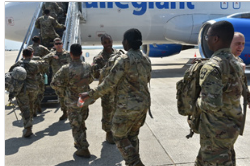
Above Soldiers from the 9th Hospital Center, 1st Medical Brigade, deploy from Fort Hood to the New York City area, March 26, 2020, where they will begin augmenting local medical professionals in the fight against COVID-19.