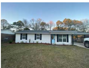
164 Sequoia Circle Hinesville

No second look needed! This is a magnificent, waterfront view, three bedroom, and two full bath home. This home features a spacious, entertaining-sized living room to accommodate large family gatherings. It showcases an open living room/kitchen combo. The kitchen includes a full window-wall that brings the beauty of the outside to your chair side. This stunning home features a wrap around driveway. Outback you will find a beautiful waterfront view with a dock where a boat floater could be installed. Your family's dream Coast home can be reality. This property is located on deep-water and minutes to St. Catherine's Island. Jimmy Shanken, Coldwell Banker Southern Coast, 912-368-4300 or 912-977-4733 or email jimmy.shanken@coldwellbanker.com