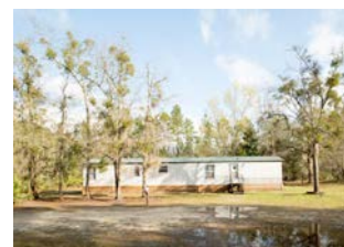
310 Ed Powers Boulevard Hinesville - $74,900

Be First! This is a stunning three bedroom, two bath mobile home. This home is very spacious! It features a warm and cozy fireplace in the living room, great to gather around with family and friends. It showcases a very open kitchen, perfect for big family gatherings and holidays. The master bathroom includes a separate shower, garden tub, double vanities for a both his and her side, and also a spacious walk-in closet. This home is located in Long County. Jimmy Shanken, Coldwell Banker Southern Coast, 912-368-4300 or 912-977-4733 or email jimmy.shanken@coldwellbanker.com