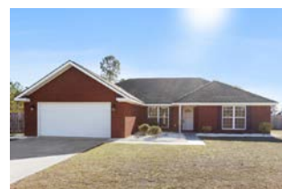
264 Madison Belle Lane NE Ludowici - $204,900

Completely remodeled home. Like new construction but without the hefty price tag. This property has an open kitchen/living room concept. It has new soft close kitchen cabinets, new laundry room off of the kitchen/dining area. This property has new flooring throughout and perfect for allergy sufferers. Brand new roof as well as HVAC. This is a must see! Jimmy Shanken, Coldwell Banker Southern Coast, 912-368-4300 or 912-977-4733 or email jimmy.shanken@coldwellbanker.com