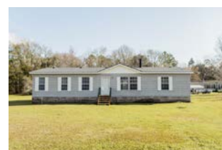
205 Cathy Road NE Ludowici - $114,900

master bedroom features a nice sized walk-in closet. Outback you will find a partial wooden fence and a chain link fence in the back yard. This home is perfect for starting new family traditions and for celebrating all holidays! Jimmy Shanken, Coldwell Banker Southern Coast, 912-368-4300 or 912-977-4733 or email jimmy.shanken@coldwellbanker.com