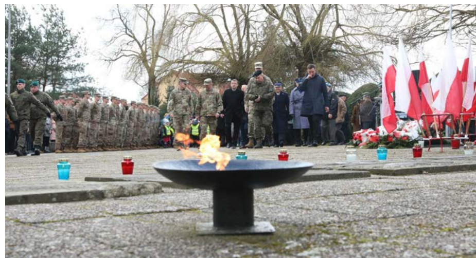
U.S. Soldiers and Polish troops walk through The Polish War Cemetery to pay their respects to fallen Polish soldiers who made the ultimate sacrifice by placing candles and wreaths on their headstones on March 4, 2020, in Drawsko Pomorskie.

U.S. Soldiers and Polish troops, as well as local citizens, paid their respects to the fallen Polish service-members by placing candles and wreaths on their headstones.