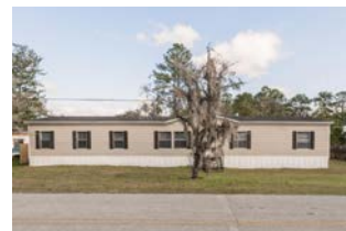
101 Boundary Street NE Ludowici - $109,900

MOVE IN READY! Beautiful brick one story home on a 1.05 acre of land. Privacy fenced backyard, large utility shed and more. No city taxes! This 4 bedrooms, 2 baths, split floor plan. Freshly painted, newly installed laminate wood floors and carpets. Formal dining room with octagon ceiling, arched doorways, judges panels, crown molding and plenty of day light. Family room with fireplace, pan ceiling and more crown moldings throughout the house. Kitchen and large breakfast area, refrigerator, stove, dishwasher and microwave. Large master bedroom with walk-in closet, separate shower, garden tub, double sinks and private toilet area. Laundry room and 2 car garage. Less than 15 minutes to Fort Stewart gate 7, shopping, restaurants... Jimmy Shanken, Coldwell Banker Southern Coast, 912-368-4300 or 912-977-4733 or email jimmy.shanken@coldwellbanker.com