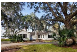
595 Drum Point Way Midway - $395,000

Great starter home at a price that you cannot beat. Three bedrooms, one bath, new roof installed 2017, covered carport, and fenced in backyard. Conveniently located to Post, shopping, schools, and restaurants. Jimmy Shanken, Coldwell Banker Southern Coast, 912-368-4300 or 912-977-4733 or email jimmy.shanken@coldwellbanker.com