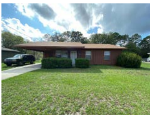
631 Fleming Road Hinesville - $71,000

carpet installed which should be completed just in time for you and your family to move in. The walls have also been freshly painted throughout the entire home. Jimmy Shanken, Coldwell Banker Southern Coast, 912-368-4300 or 912-977-4733 or email jimmy.shanken@coldwellbanker.com