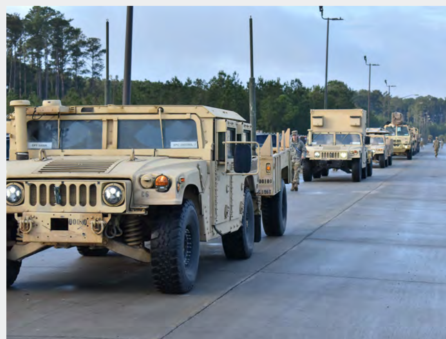
Vehicles assigned to 9th Brigade Engineer Battalion, 2ABCT, travel in a convoy to the rail marshalling area at Fort Stewart, Jan. 27.