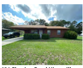
631 Fleming Road Hinesville -$71,000

4300 or 912-977-4733 or email jimmy.shanken@coldwellbanker. com