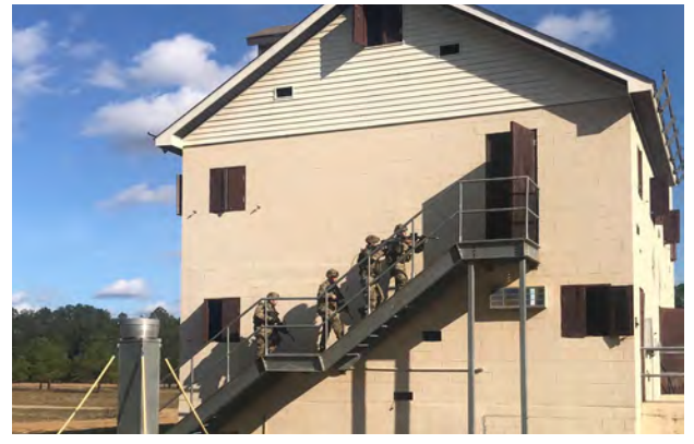
A team from Co. A, 2-7, 1ABCT, 3ID, maneuvers to clear the second story of the structure in the Urban Assault Course on Jan. 16, Fort Stewart.