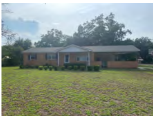
535 2nd Street Hinesville - $86,500

Why rent when you can own for much less? Perfect starter home in the center of town. Charming 3 bedroom 2 bathroom home in a quiet subdivision that is within walking distance to several stores and restaurants. Home is being sold as is. Co-Listed with Nikki Gaskin (912) 610-8304. Jimmy Shanken, Coldwell Banker Holtzman, REALTORS, 912-368-4300 or 912-977-4733 or email jimmy.shanken@coldwellbanker.com