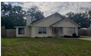
803 Shadow Walk Lane Hinesville - $149,900

Why rent when you can own for much less? Perfect starter home in the center of town. Charming 3 bedroom 2 bathroom home in a quiet subdivision that is within walking distance to several stores and restaurants. Home is being sold as is. Co-Listed with Nikki Gaskin (912) 610-8304. Jimmy Shanken, Coldwell Banker Holtzman, REALTORS, 912-368-4300 or 912-977-4733 or email jimmy.shanken@coldwellbanker.com