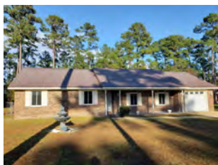
356 Bright Lakes Road Hinesville - $194,700

This adorable 3 bedroom 3 bath town home is located less than 3 miles to Ft. Stewart, Georgia gate 7. This property has an open floor plan with a galley kitchen tile back splash, breakfast bar, and stainless steel appliances. It also has a one car garage. Jimmy Shanken, Coldwell Banker Holtzman, REALTORS, 912-368-4300 or 912-977-4733 or email jimmy.shanken@coldwellbanker.com