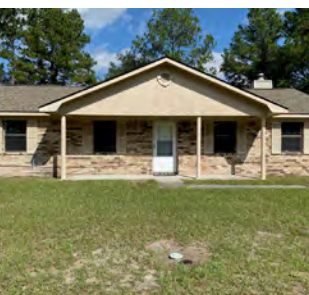
259 Whitetail Circle Hinesville - $124,000

Cute home just minutes away from Fort Stewart Gate 8, shopping and restaurants. This home features 3 bedrooms, 2 bathrooms and a fenced in yard. The fire place is the perfect spot to sit by after a long day. Jimmy Shanken, Coldwell Banker Holtzman, REALTORS, 912-368-4300 or 912-977-4733 or email jimmy.shanken@coldwellbanker.com