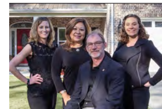
The Shanken Team REALTORS®

Coastal living! This property is within walking distance to a public boat ramp. St. Catherines and Ossabaw Island is a short boating distance away! Sunbury Crab Company is less than a 5 minute golf cart ride away. If you like