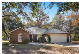
495 Hope Circle Ludowici - $267,000