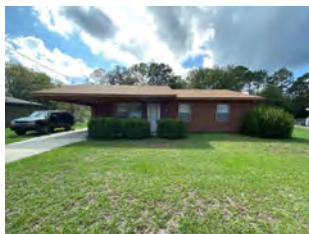
631 Fleming Road Hinesville - $71,000