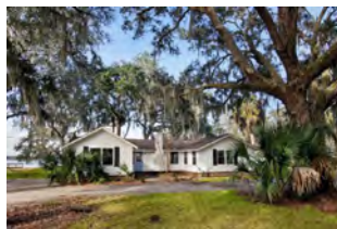
595 Drum Point Way Midway - $395,000

COUNTRY COMFORT! This is a stunning three bedroom two bath brick home. This home features an eat in kitchen and country casual dining room for friendly meal-times. It also showcases a family room and kitchen combination which is perfect for the cook who does not want to be separated from family and guests. Lets take a look outside. This home has a fenced in back yard and features a 7 1/2 acre horse pasture with an electric fence. In connection with the horse pasture fencing there is a 12 X 20 horse shelter. This property also features a 18 X 21 steel shop. This home is located in the county and has no city taxes. This home is perfect for starting family traditions and having everyone home for the holidays! Jimmy Shanken, Coldwell Banker Holtzman, REALTORS, 912-368-4300 or 912-977-4733 or email jimmy.shanken@coldwellbanker.com