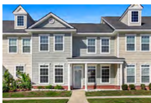
410 Conley Drive Hinesville - $137,900

Great starter home at a price that you cannot beat. Three bedrooms, one bath, new roof installed 2017, covered carport, and fenced in backyard. Conveniently located to Post, shopping, schools, and restaurants. Jimmy Shanken, Coldwell Banker Holtzman, REALTORS, 912-368-4300 or 912-977-4733 or email jimmy.shanken@coldwellbanker.com