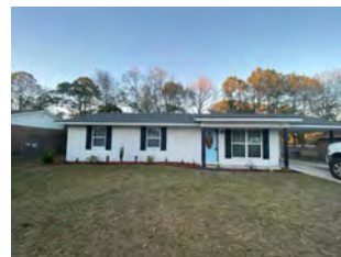
164 Sequoia Circle Hinesville - $133,900

No second look needed! This is a magnificent, waterfront view, three bedroom, and two full bath home. This home features a spacious, entertaining-sized living room to accommodate large family gatherings. It showcases an open living room/kitchen combo. The kitchen includes a full window-wall that brings the beauty of the outside to your chair side. This stunning home features a wrap around driveway. Outback you will find a beautiful waterfront view with a dock where a boat floater could be installed. Your family's dream Coast home can be reality. This property is located on deep-water and minutes to St. Catherine's Island. Jimmy Shanken, Coldwell Banker Holtzman, REALTORS, 912-368-4300 or 912-977-4733 or email jimmy.shanken@coldwellbanker.com