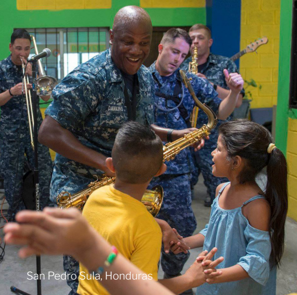
San Pedro Sula, Honduras