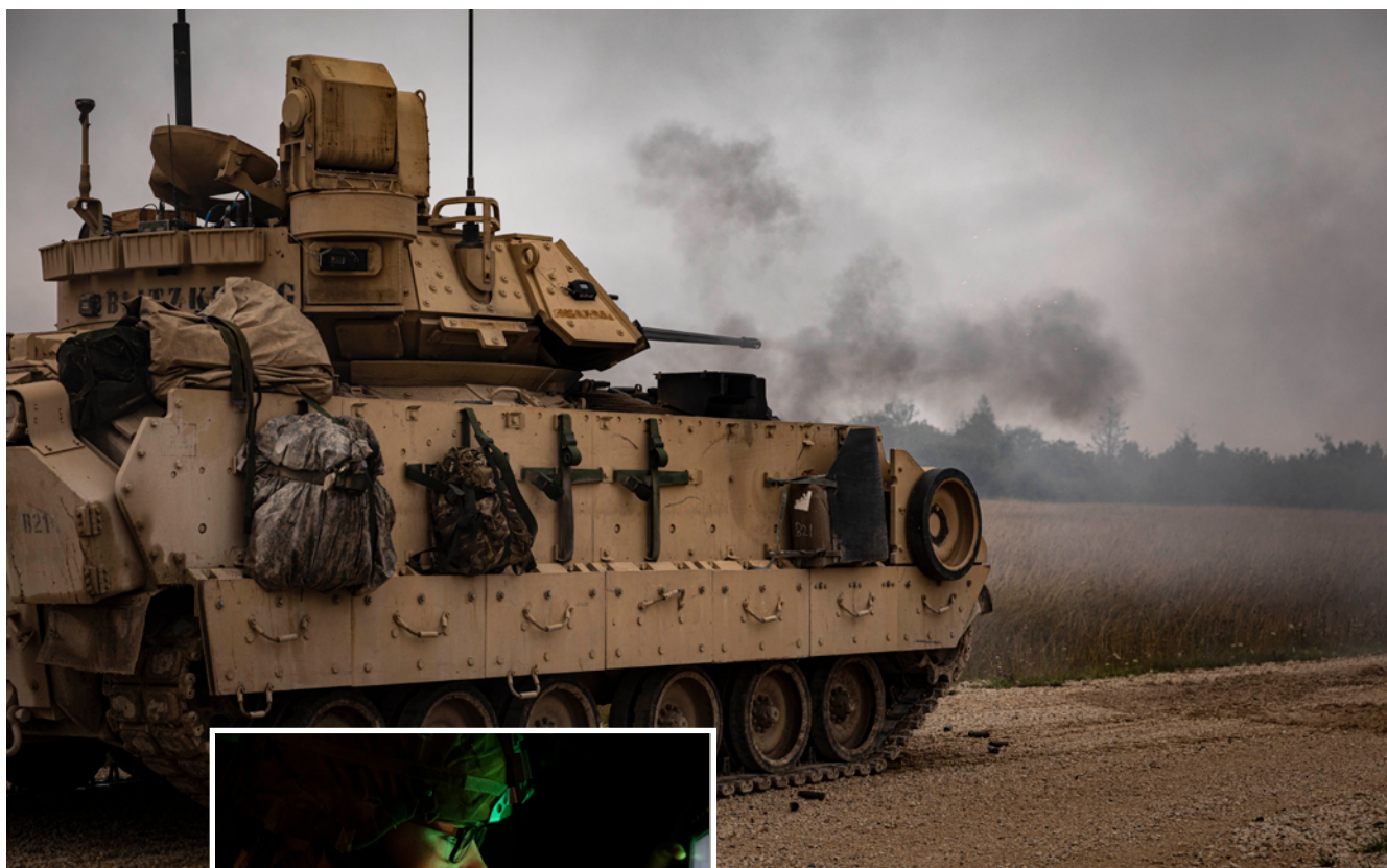
(top) A U.S. Army Bradley Fighting Vehicle with 1-4 Cav, fires rounds during a live fire range.