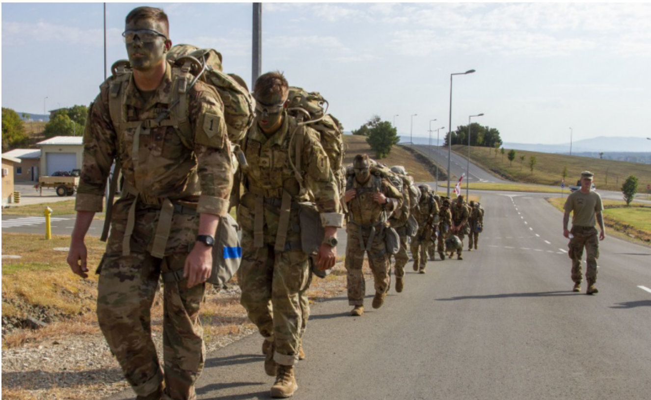
Spur Ride candidates with the 1-16th Inf. Reg. march to their next lane during a Spur Ride.