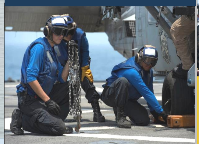
Flight Quarters! Flight Quarters!

Sailors on the flight deck during flight quarters.