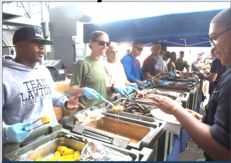
Sailors and Marines come together to serve the crew a delicious meal.