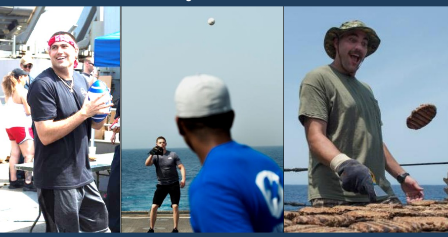
Some fun in the sun during the 4th of July Steel Beach Picnic!