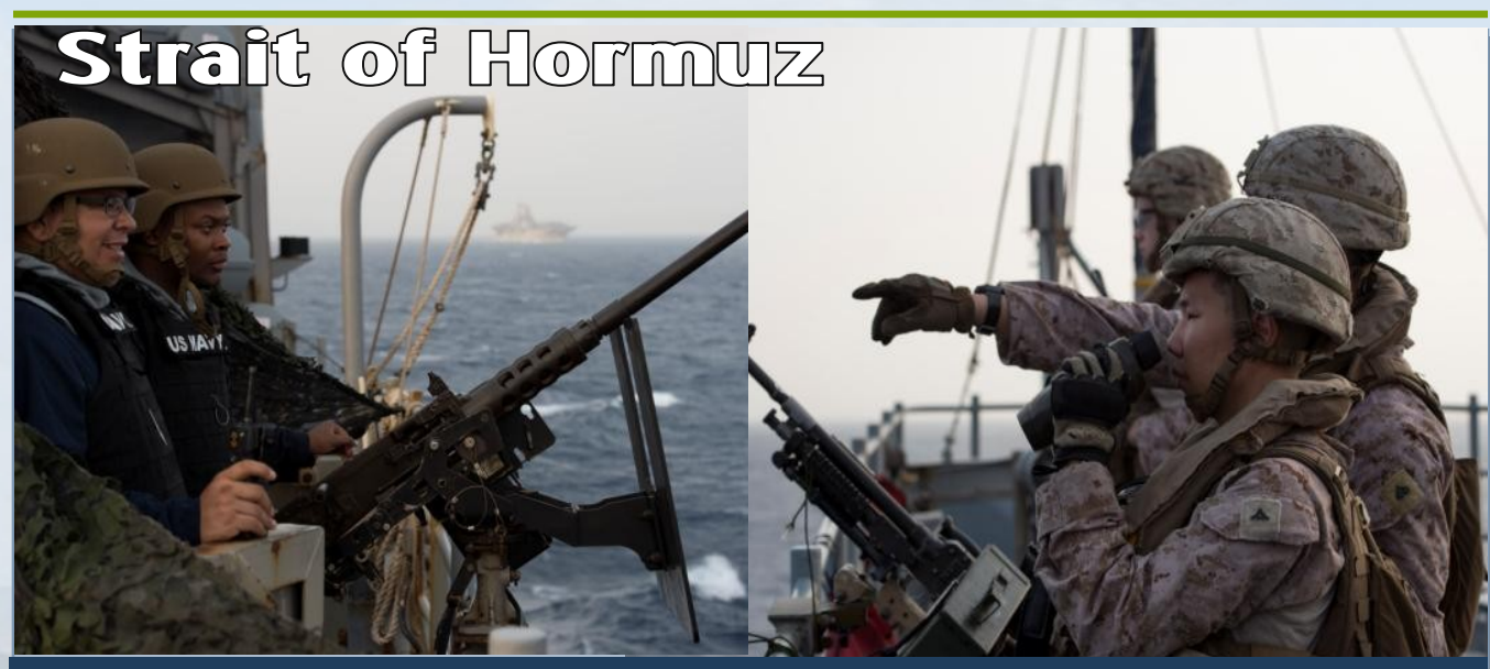
Sailors man SCAT and Marines man DATF during the transit of the Strait of Hormuz .