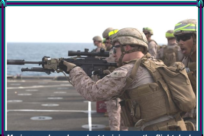
Marines on board conduct training on the flight deck.